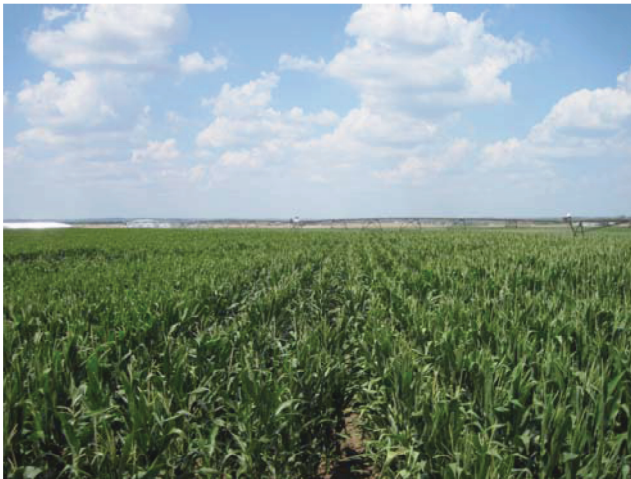
View of SHINE Site from Eastern Site Boundary, Looking West