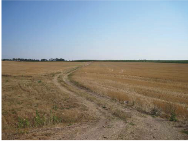
View of SHINE Site from Highway 51, Looking Northeast