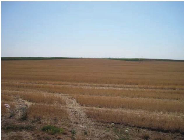
View of SHINE Site from Highway 51, Looking East