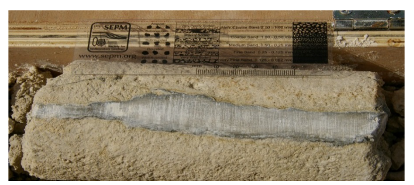
Grouted fracture sealed against fluid flow during grout testing.