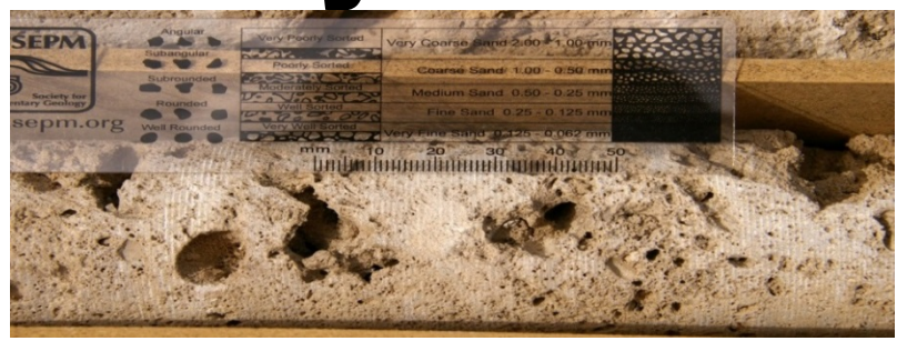
Small disconnected dissolution voids.