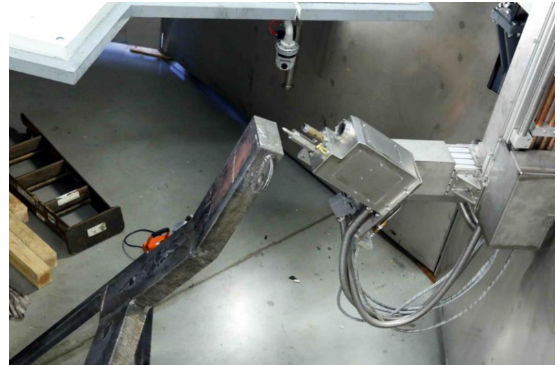
Reactor Vessel Cutting Head