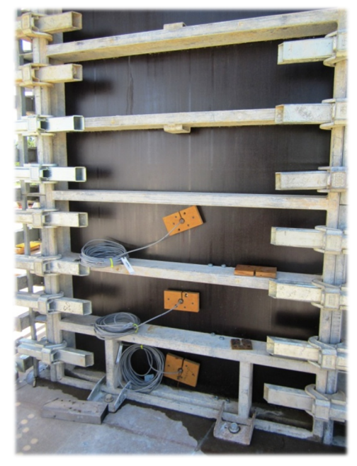
Mockup will measure form pressure