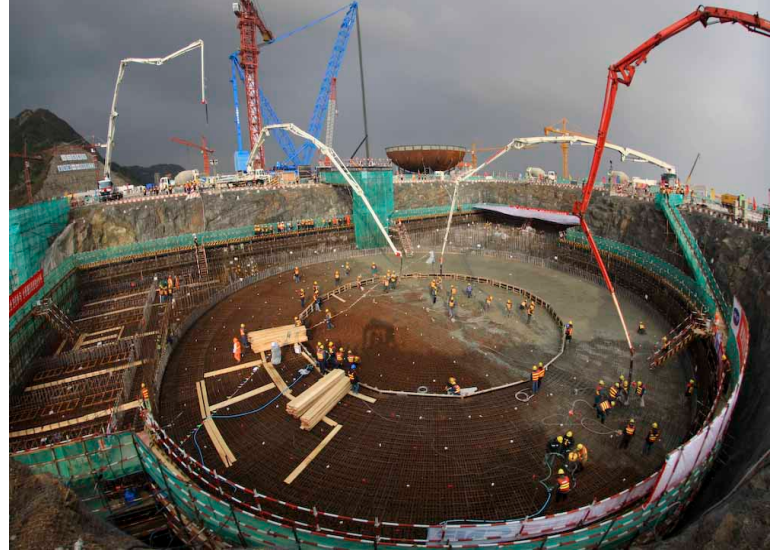
December 2009: Sanmen Base Mat Concrete Placement