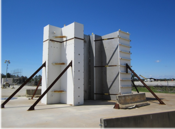
CA20 mockup for concrete placement