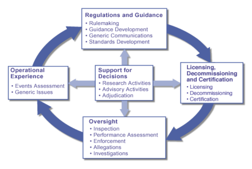
Figure 1. How the NRC Regulates

Oversight of licensed activities ensures that licensees are complying with NRC requirements and license conditions. Enforcement is an important part of the NRC's oversight activities.