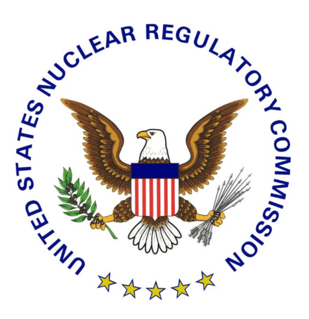
By the U.S. Nuclear Regulatory Commission

A Report for the Senate Committee on Environment and Public Works and the House Committee on Energy and Commerce