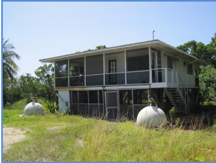
Exterior of the McGregor Smith Ranger House