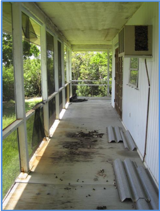
Upstairs screened wrap-around porch