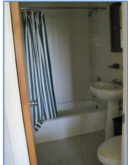
Interior photographs of the upstairs living/meeting spaces, which include a living/dining room combo, small kitchen, separate bathroom, and separate bedroom that is being used as a conference room.