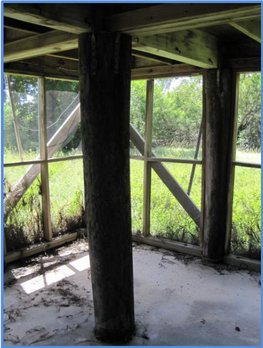
Support beams, ground floor, enclosed with screens