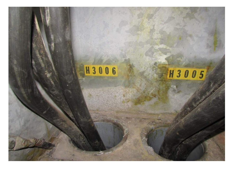
Attachment 1 Images of Flooding Vulnerabilities Identified and Corrected at ANO-1

"As-found" (top) and "As-left" (bottom) condition of embedded 6.9kV conduits which penetrate the Turbine and Auxiliary Building at ANO-1. Some of the penetrations are in floors or walls that are flood boundaries.