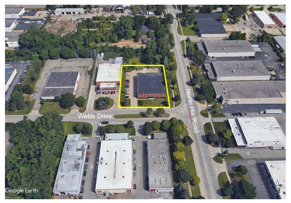
Figure 3. Area Surrounding NC Servo Technologies, Westland, Michigan (August 2016) (Google Earth Pro 2017)