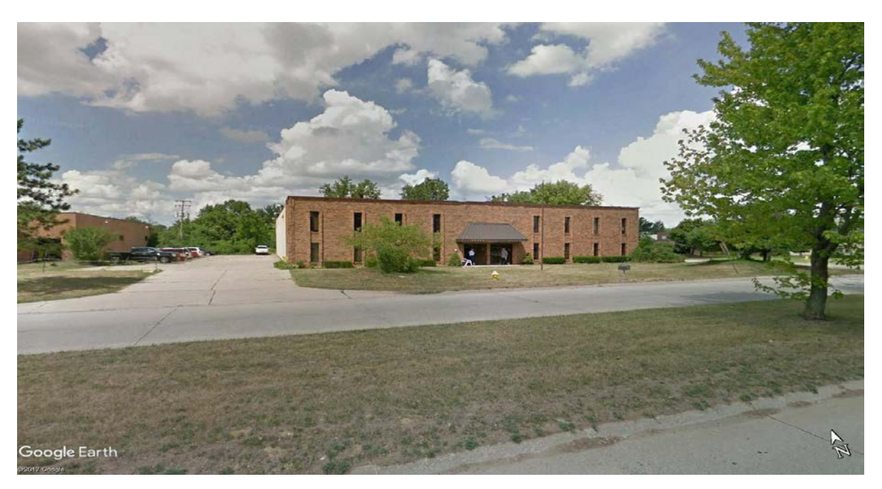
Figure 1. Street View of NC Servo Technology (August 2016)