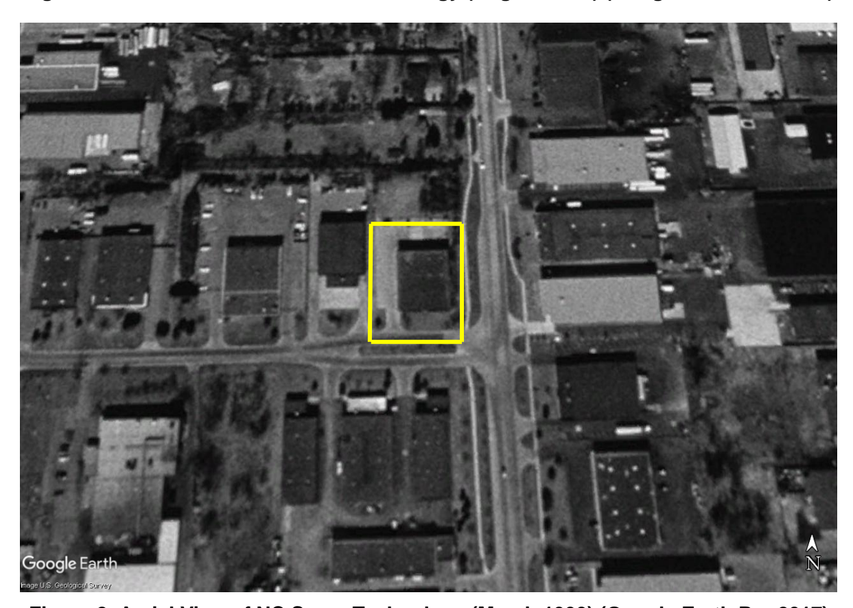
Figure 2. Aerial View of NC Servo Technology (March 1999)