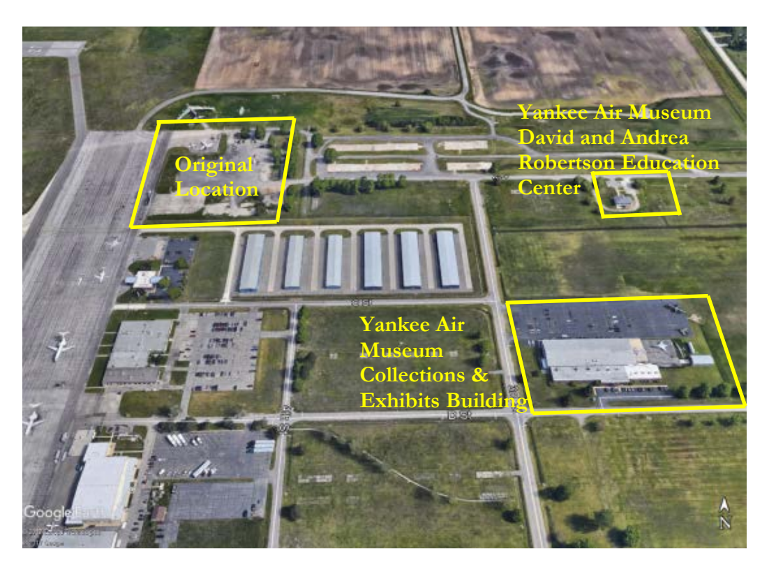
Figure 5. Aerial View of Original Site (Address 1) and Current Site (Address 2) for Yankee Aircraft Museum in 2017 (Google Earth Pro 2017)