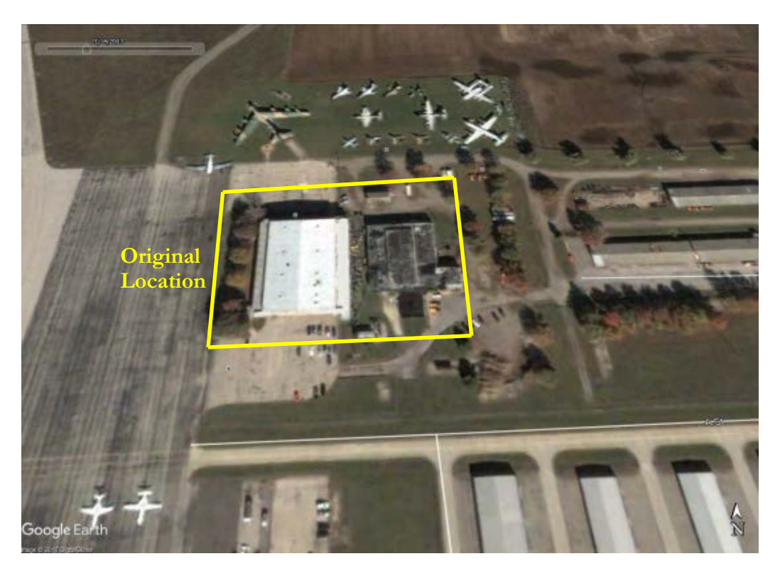
Figure 1. Yankee Aircraft Museum, Address 1, on 11/14/2003 (before fire in 2004)