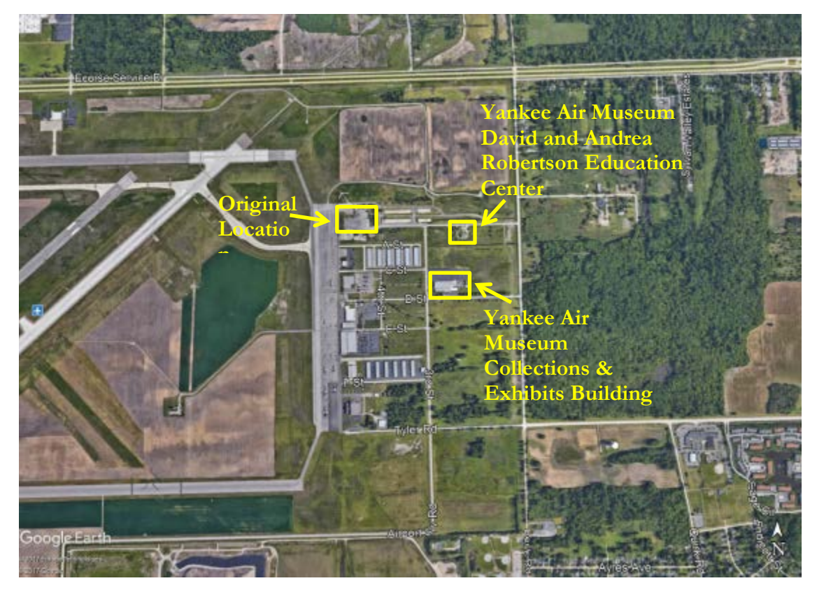
Figure 7. Aerial View of Surrounding Areas for Yankee Aircraft Museum (Addresses 1 and 2) in 2017

The current owner of the areas occupied by the Yankee Aircraft Museum (and all Willow Run Airport property) is the Wayne County Airport Authority located at 1 Detroit Metro Airport, Detroit, Michigan 48242.