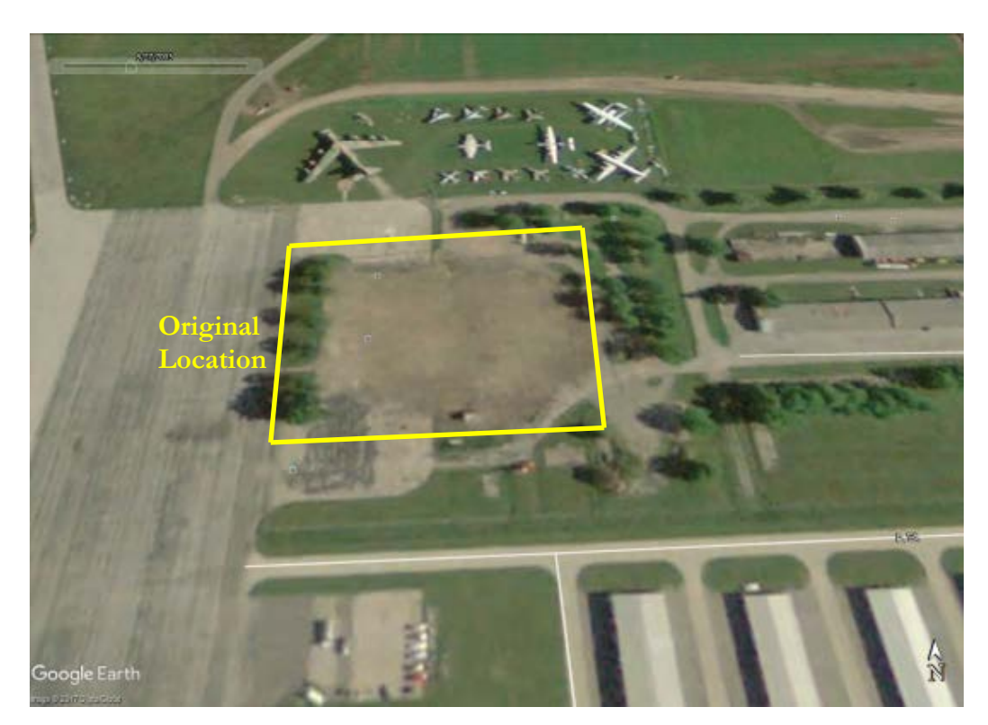
Figure 3. Yankee Aircraft Museum, Address 1, on 08/27/2005 (cleanup after fire in 2004) (Google Earth Pro 2017)