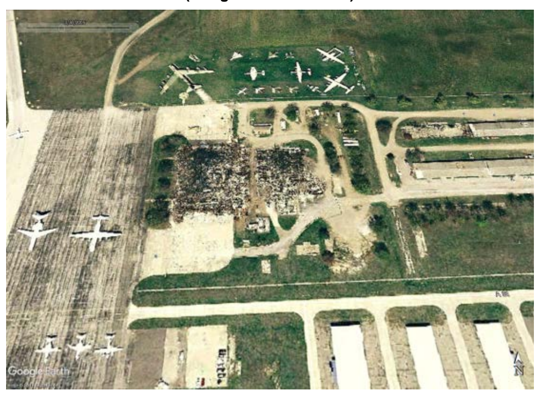
Figure 2. Yankee Aircraft Museum, Address 1, on 03/30/2005 (after fire in 2004)