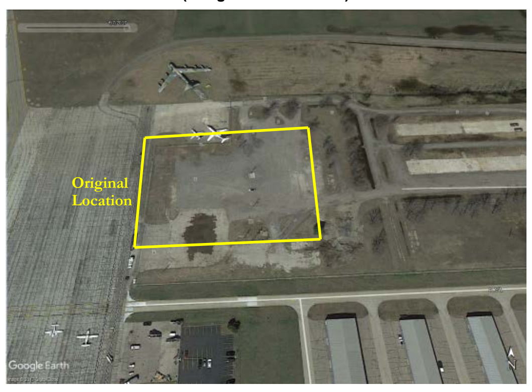
Figure 4. Yankee Aircraft Museum, Address 1, on 04/07/2017 (Google Earth Pro 2017)