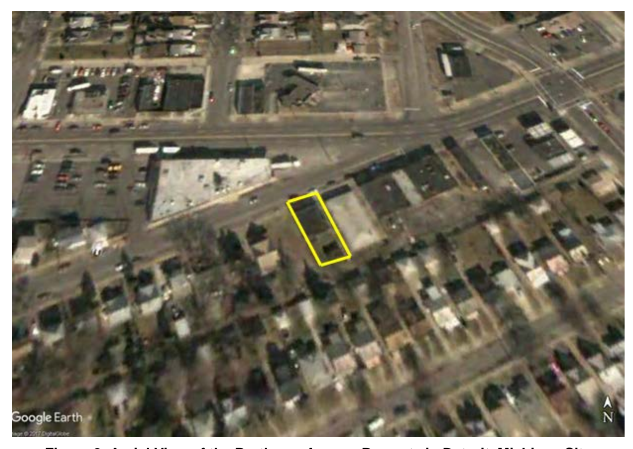
Figure 3. Aerial View of the Portlance Avenue Property in Detroit, Michigan Site from March 2002 (Google Earth Pro 2017)