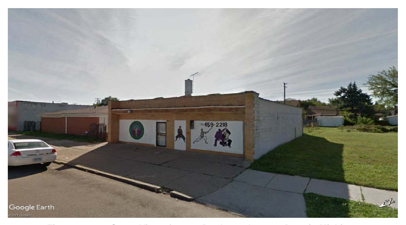
Figure 1. 2013 Street View of 11496 Portlance Avenue, Detroit, Michigan from September 2013 (Google Earth Pro 2017)