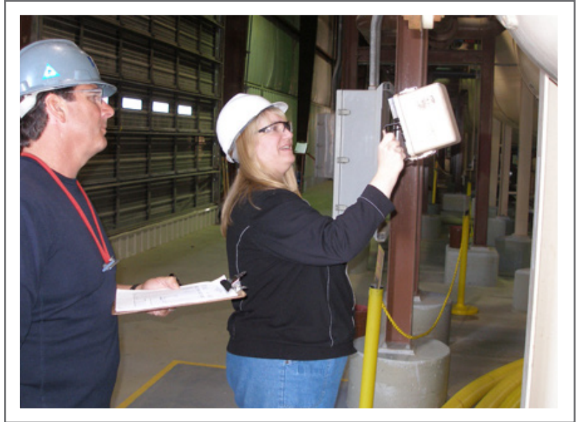
Gamma radiation survey

defined through licensing and continuing regulatory oversight and enforcement throughout all stages in the lifetime of a facility. This approach is the means by which the NRC ensures the successful outcome of the safe use of radioactive materials.