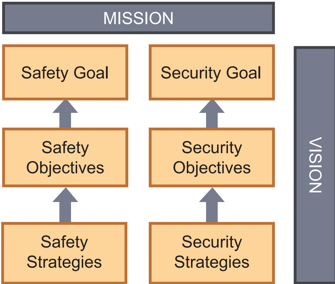
Figure 1 Graphical depiction of strategic plan components

Appendix A covers key external factors that could affect the agency’s ability to effectively execute this plan.