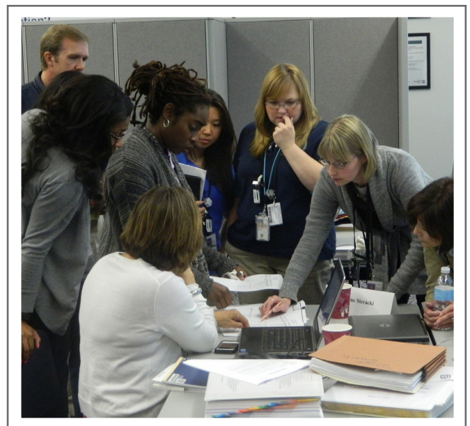
Safety Culture Assessment Team