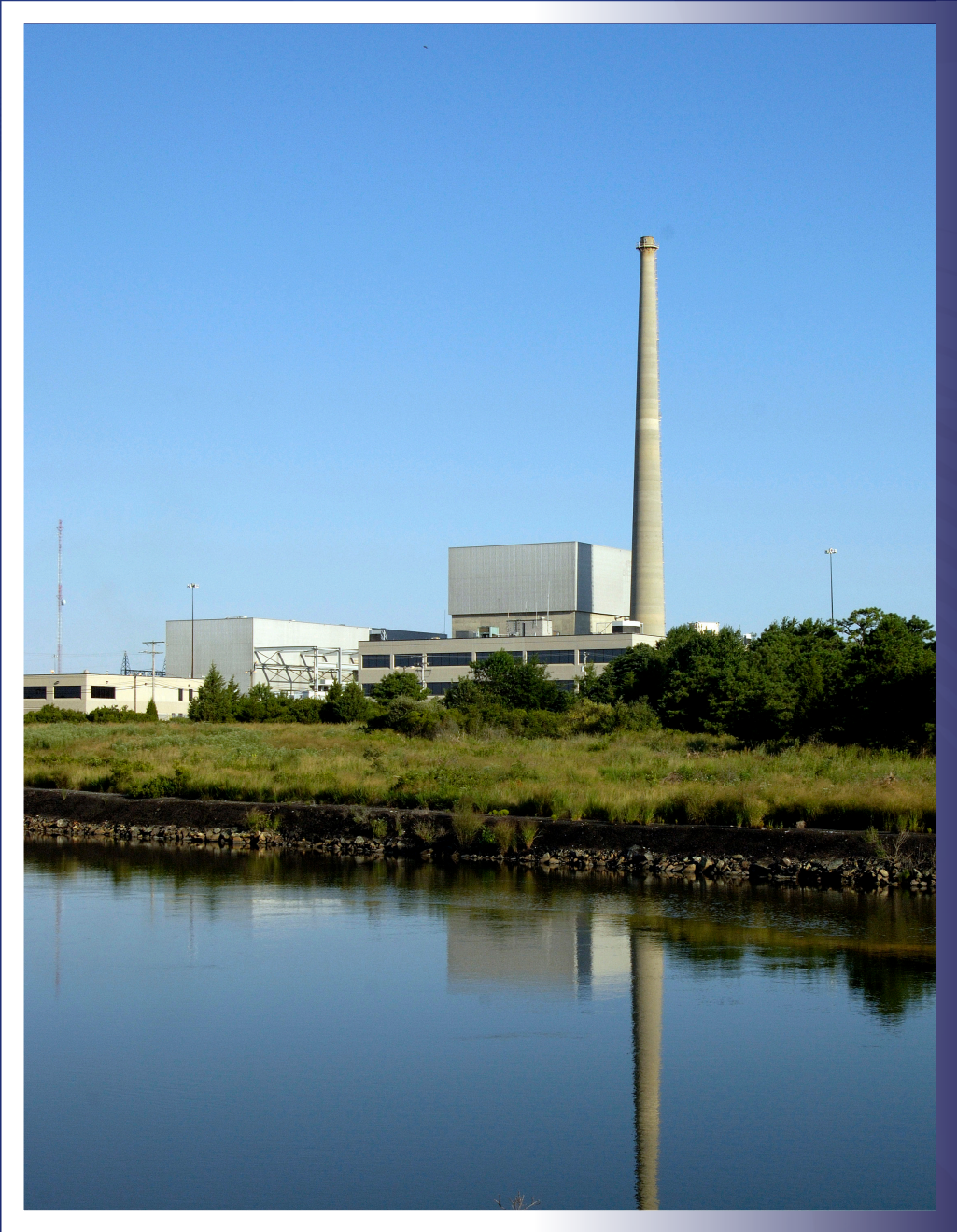
Oyster Creek Nuclear Power Station