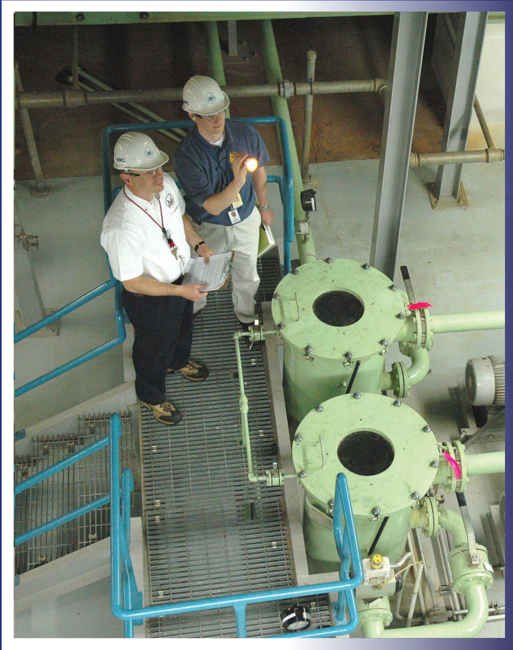
NRC Inspectors at Wolf Creek Generating Station