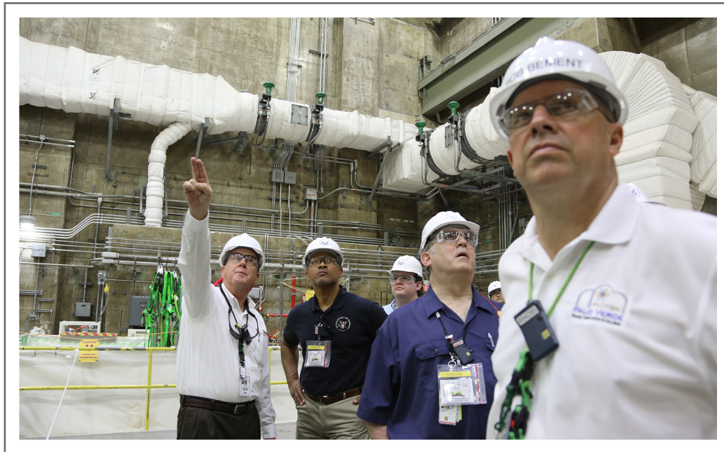
NRC Executive Director tour of Palo Verde Nuclear Generating Station

Security Strategy 5: Support U.S. national security interests and nuclear nonproliferation policy objectives consistent with the NRC’s statutory mandate through cooperation with domestic and international partners.