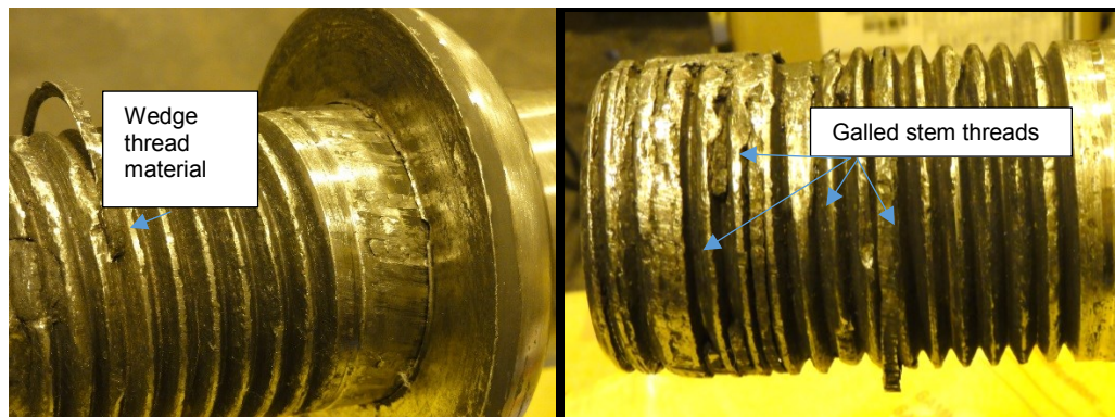
Figure 1 - As-Found Stem of Failed 2E22-F004 Valve