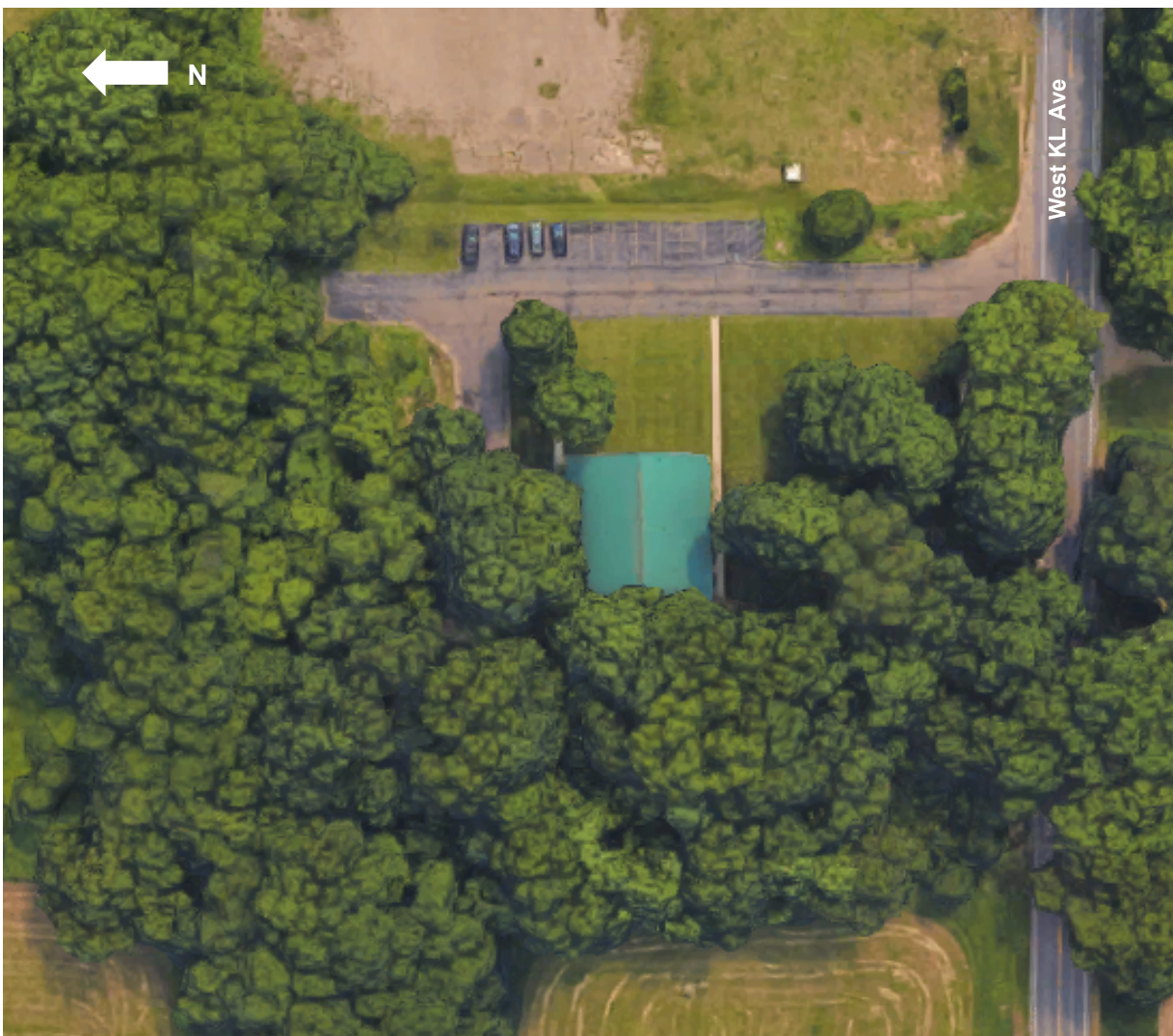
Figure 1. Aerial View of Precision Dial Company

The Precision Dial Company is located in a single-storied building and consists of metal walls (garage-type structure) with painted concrete floors. Roughly 75% of the floor space was accessible for the survey. Access to areas was limited by work equipment (i.e., work desks, filing cabinets, printers, ovens, etc.). The land area consists mostly of grass with an asphalt parking lot located to the east of the building. A shed is located to the north of the building. Liquid waste from the stripping process is stored in the shed until pickup by a disposal service. Figure 1 presents an aerial view of the property. Figure 2 presents the layout of the building.