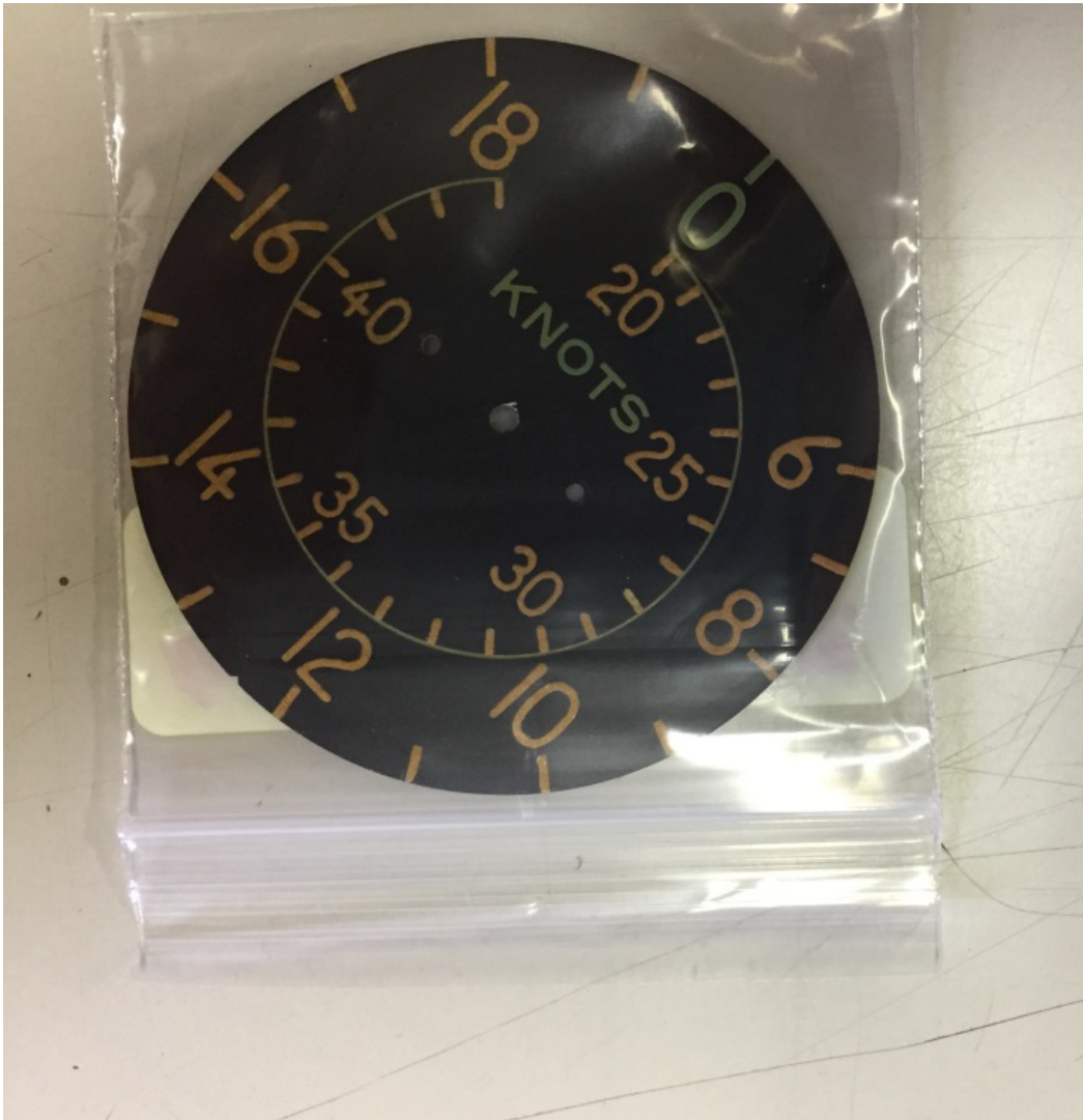
A-1. Faceplate with Elevated Levels of Radiation