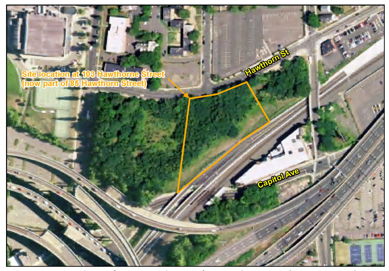
Figure 1. Aerial View of approximate location of 103 Hawthorne Street (USDA-APFO 2016).