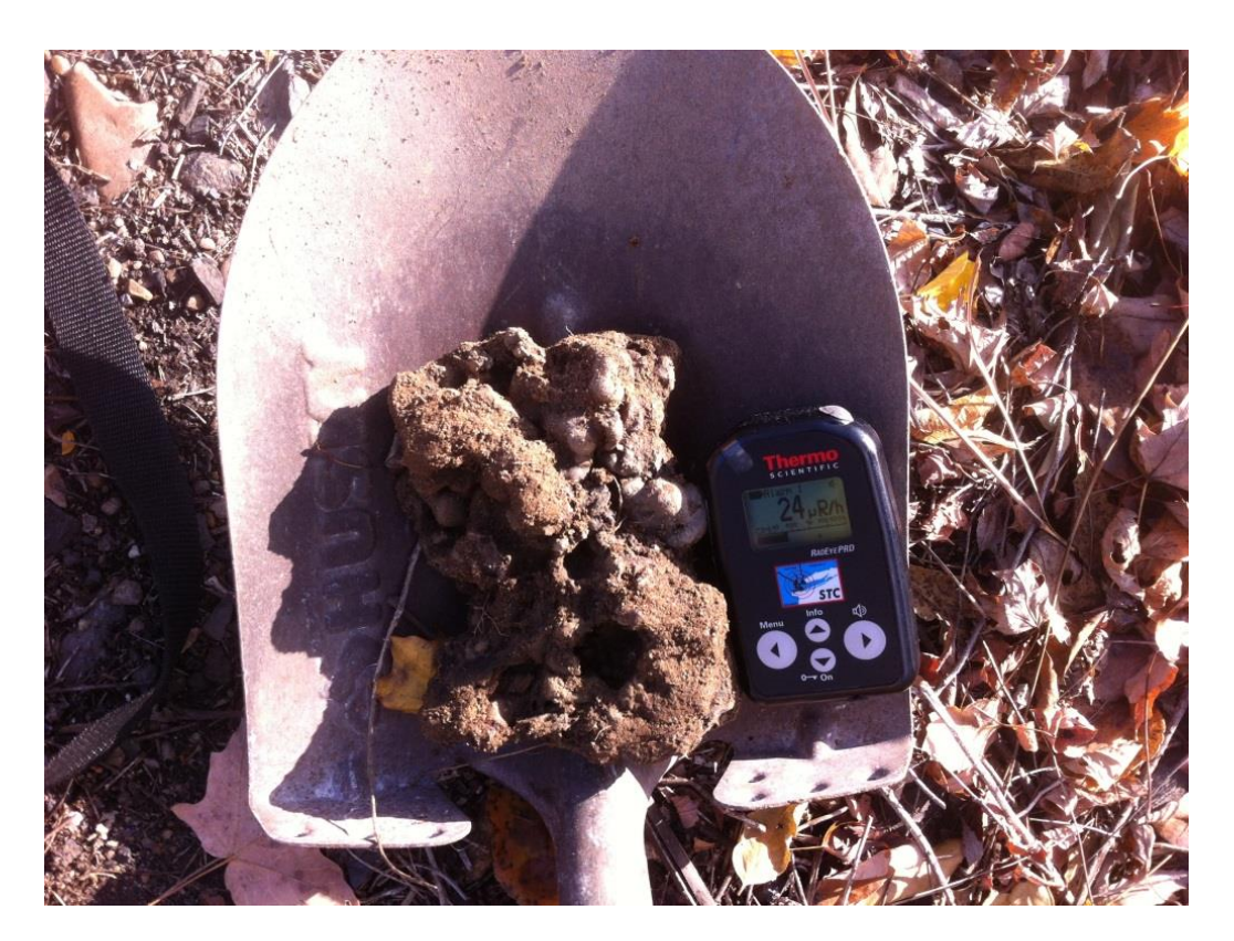
Figure A.1. Slag-like material removed from location A