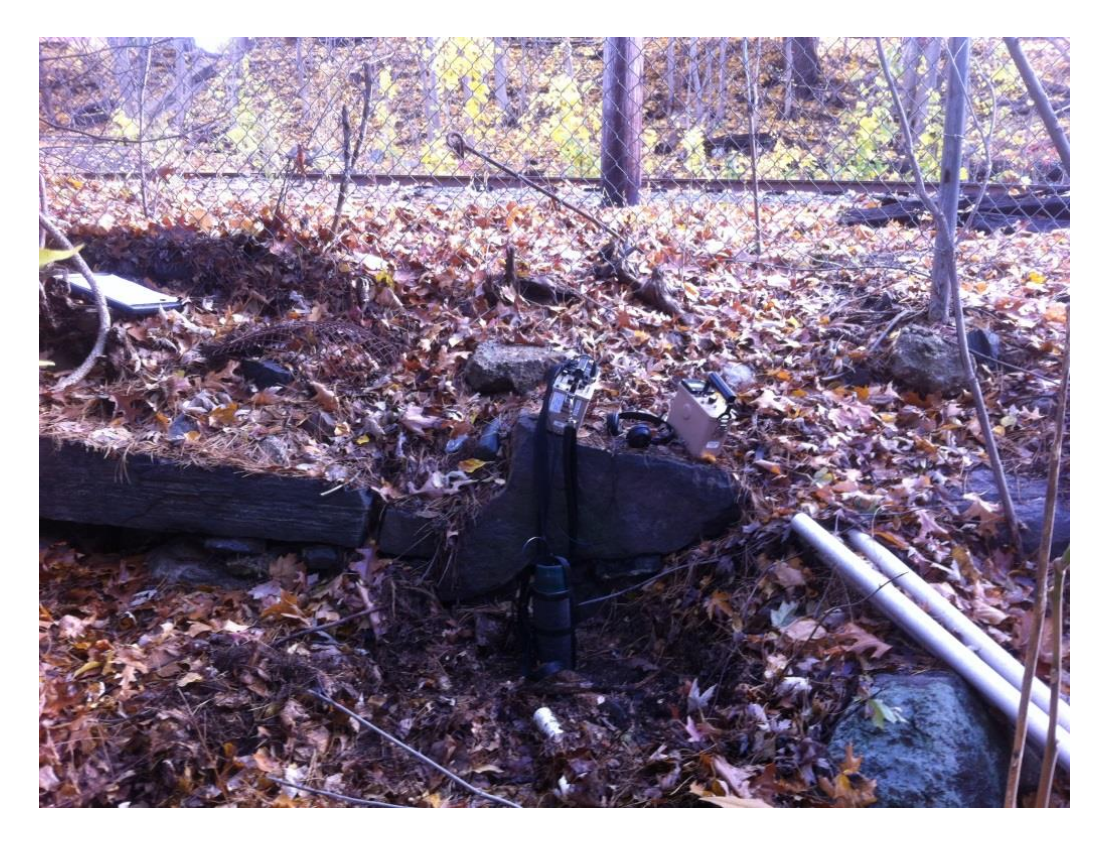
Figure A.2. Small Stone Wall East of the DeLorenzo Towers Property