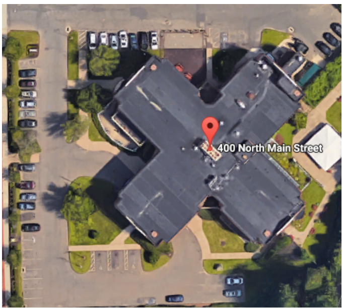
Figure 1. Aerial Photo of 400 North Main Street.

During the 1960s, the abandoned buildings at the North Main Street location were torn down as part of a redevelopment project. Extensive testing took place at the site prior to 1980, however neither the exact dates of testing nor the types of tests performed are known. Therefore, it is unknown if soil at the North Main Street location of the former Ingraham Company was tested for radium (ORNL 2015). At the time of site redevelopment, soil from the site was cleared for use as cover material at a Bristol landfill, a river running through the site was piped underground, and backfill was brought onto the site. As part of the redevelopment, residential and commercial properties were constructed at the North Main Street locations, including: (1) 430 N. Main Street in the early 1980s; (2) 284 N. Main Street in 1987; (3) 400 N. Main Street in 1989-90; and (4) 420 N. Main Street in 1990-91 (ORNL 2015). This report documents the initial site visit to the portion of the Ingraham property that is currently associated with 400 N. Main Street, pictured in Figure 1.