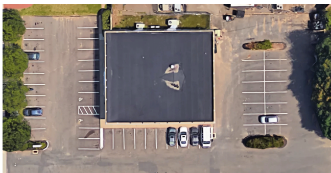
Figure 1. Aerial Photo of 420 North Main Street

During the 1960s, the abandoned buildings at the North Main Street location were torn down as part of a redevelopment project. Extensive testing took place at the site prior to 1980, however neither the exact dates of testing nor the types of tests performed are known. Therefore, it is unknown if soil at the North Main Street location of the former Ingraham Company was tested for radium (ORNL 2015). At the time of site redevelopment, soil from the site was cleared for use as cover material at a Bristol landfill; a river running through the site was piped underground, and backfill was brought onto the site. As part of the redevelopment, residential and commercial properties were constructed at the North Main Street locations, including: (1) 430 N. Main Street in the early 1980s; (2) 284 N. Main Street in 1987; (3) 400 N. Main Street in 1989-90; and (4) 420 N. Main Street in 1990-91 (ORNL 2015). This report documents the initial site visit to the portion of the Ingraham property that is currently associated with 420 N. Main Street, pictured in Figure 1.