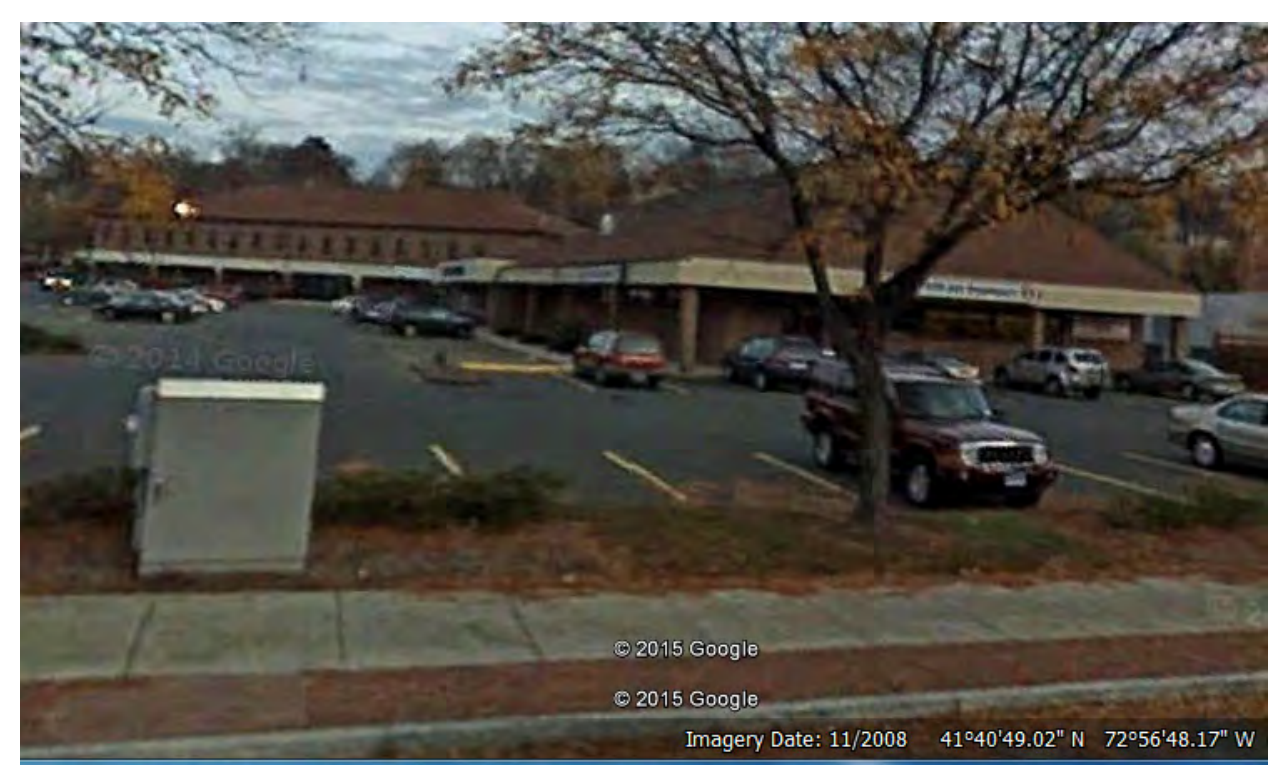
Figure 5. 430 N. Main St. (Strip mall) (Google, 2015)