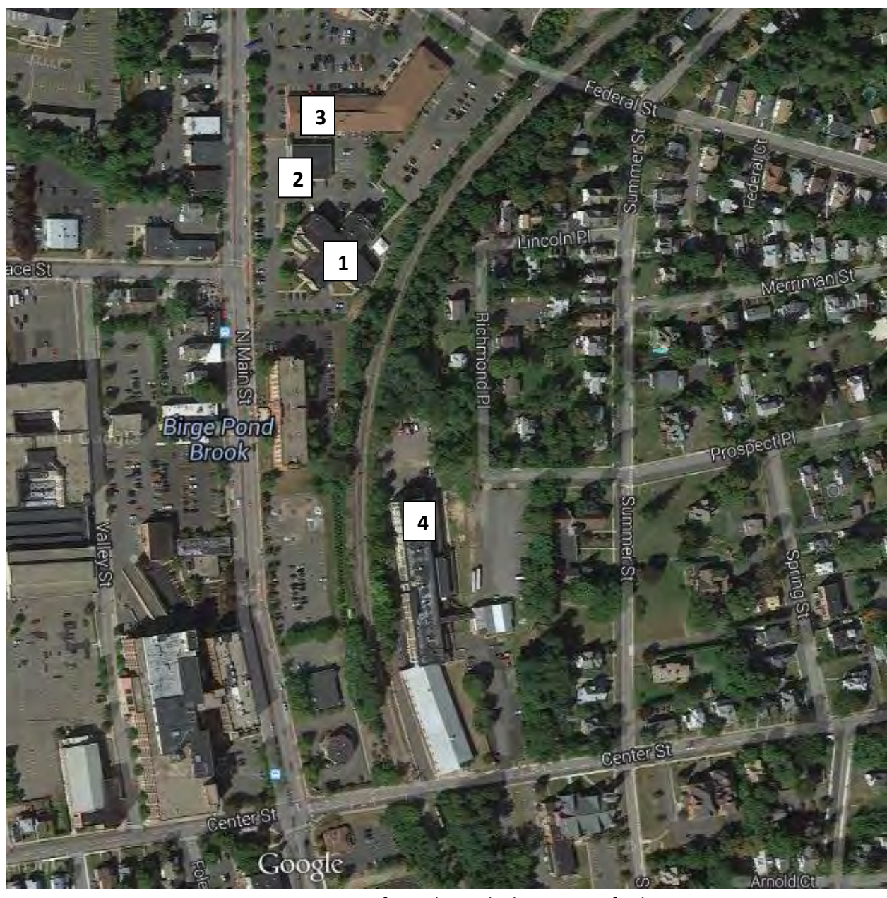
Figure 1. Locations of Ingraham Clock Company facilities (1- 400 N. Main St. (now Ingraham Manor), 2- 420 N. Main St. (now medical offices), 3- 430 N. Main St. (now a strip mall), 4- 284 N. Main St. (now DeLorenzo Towers) (Google Earth, 2015)