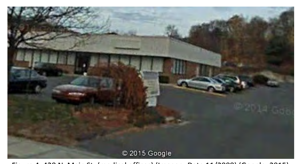
Figure 4. 420 N. Main St. (medical offices) (Imagery Date 11/2008) (Google, 2015)