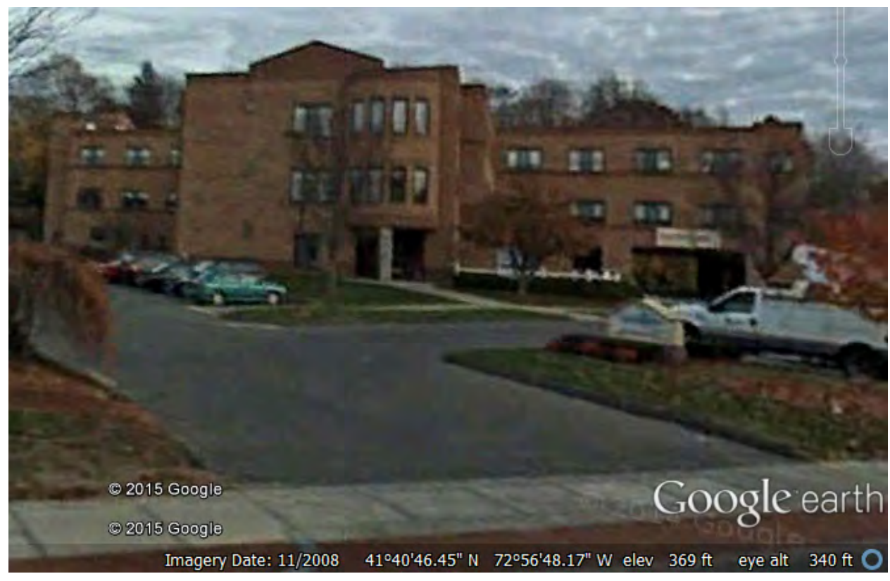
Figure 3. 400 N. Main St. (Ingraham Manor)