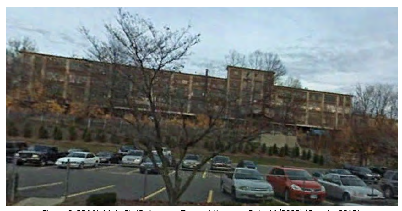
Figure 6. 284 N. Main St. (DeLorenzo Towers) (Imagery Date 11/2008) (Google, 2015)

The former location of Ingraham Clock Company (from 1958 to 1967) at 210 Redstone Hill Road is currently occupied by Rowley Spring and Stamping (Figure 7).