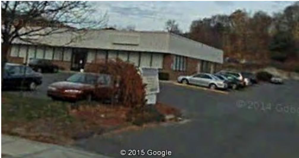
Figure 4. 420 N. Main St. (medical offices) (Imagery Date 11/2008) (Google, 2015)