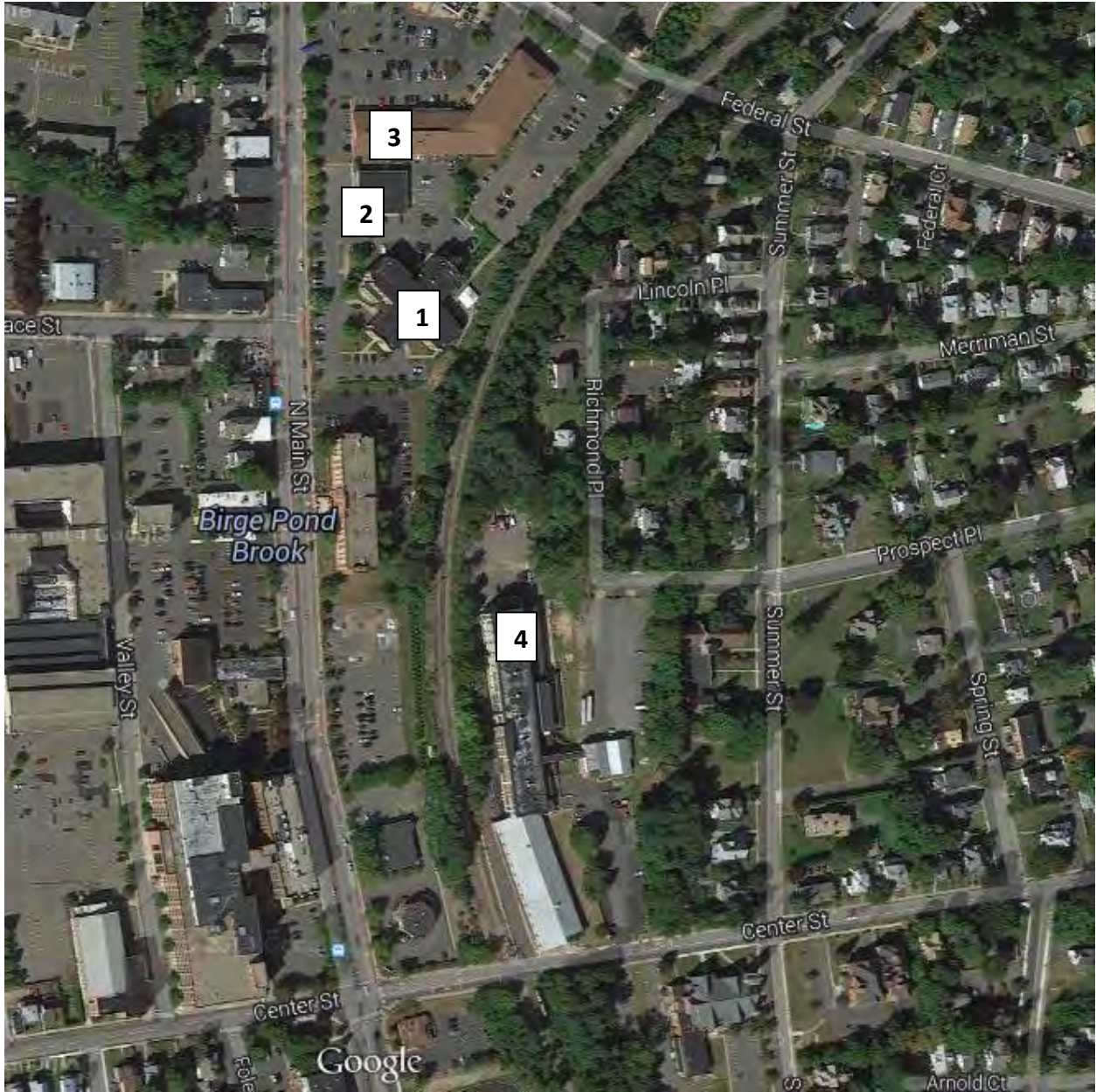
Figure 1. Locations of Ingraham Clock Company facilities (1- 400 N. Main St. (now Ingraham Manor), 2- 420 N. Main St. (now medical offices), 3- 430 N. Main St. (now a strip mall), 4- 284 N. Main St. (now DeLorenzo Towers) (Google Earth, 2015)