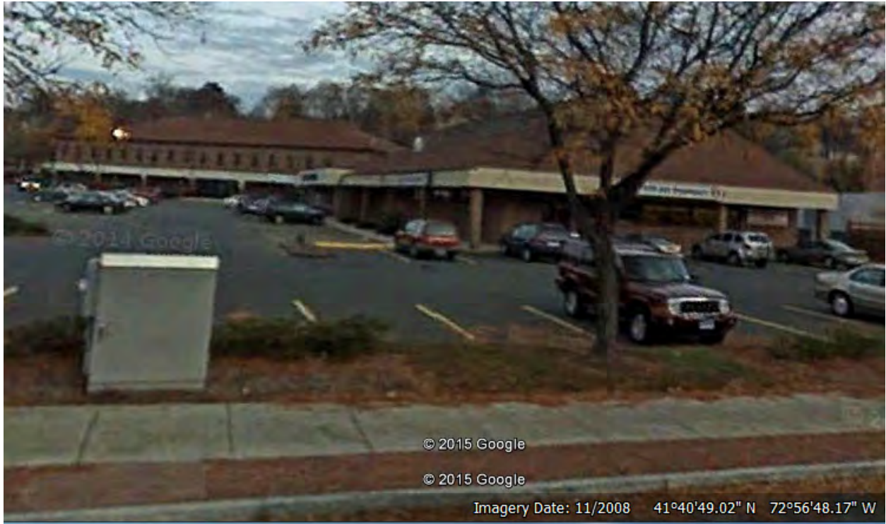
Figure 5. 430 N. Main St. (Strip mall) (Google, 2015)