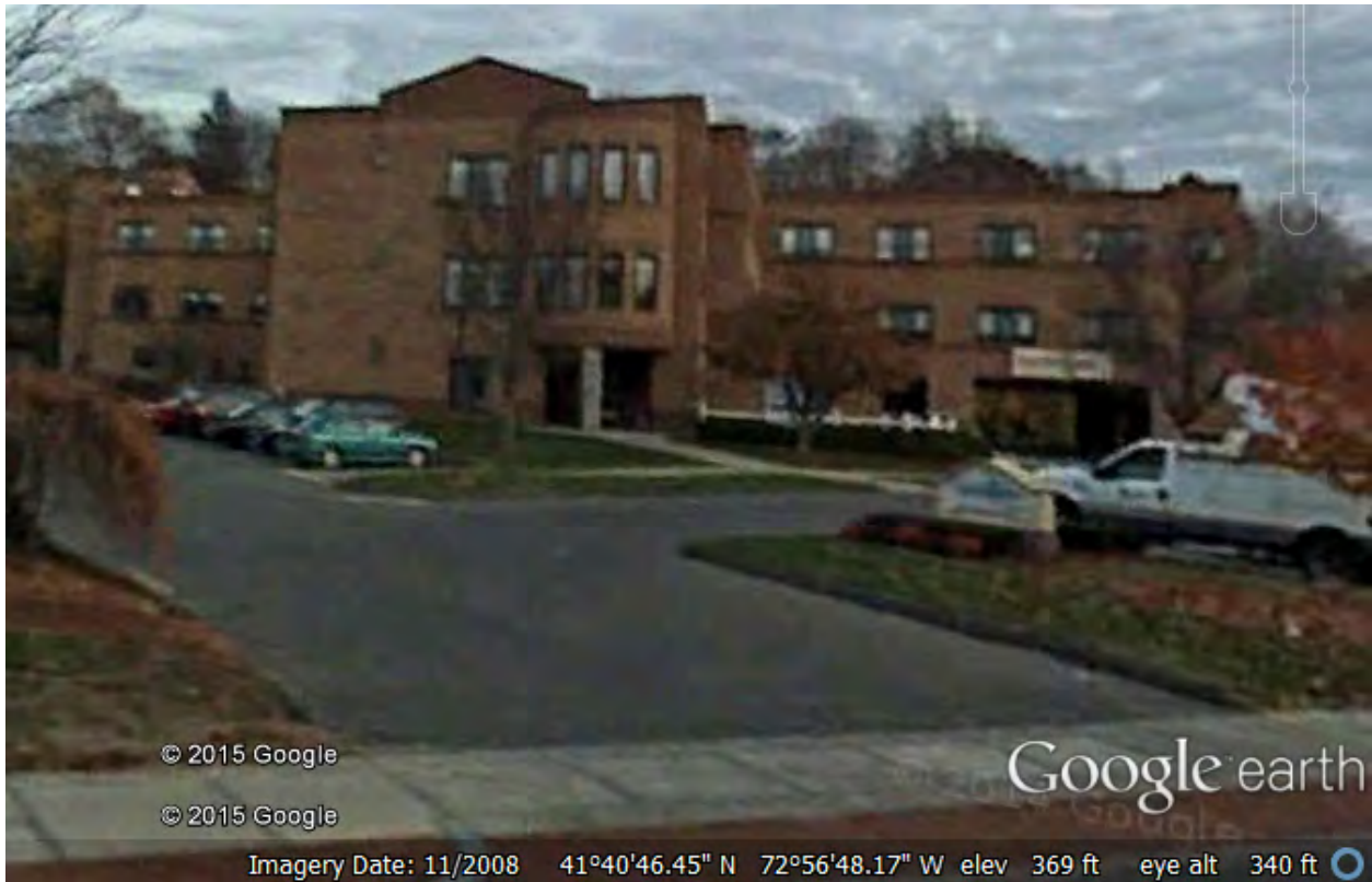
Figure 3. 400 N. Main St. (Ingraham Manor) (Google, 2015)