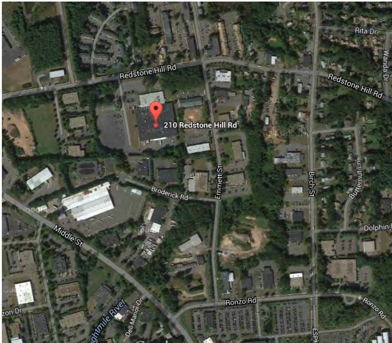
Figure 2. 210 Redstone Hill Rd.