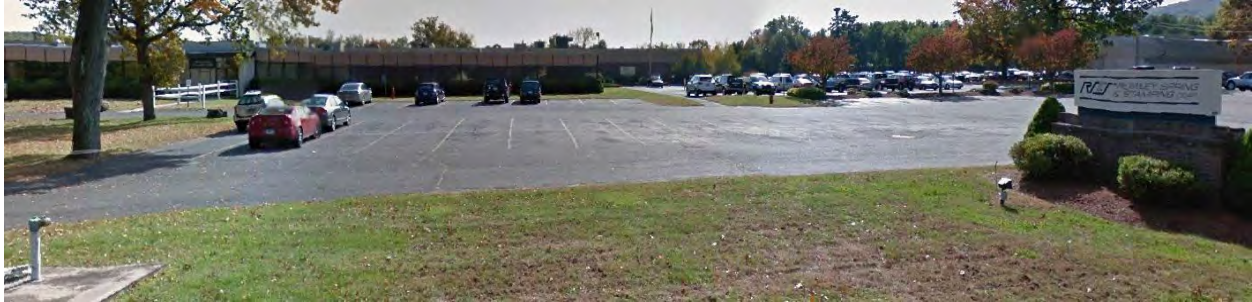
Figure 7. 210 Redstone Hill Road (Rowley Spring and Stamping) (Imagery Date October 2012) (Google, 2015)