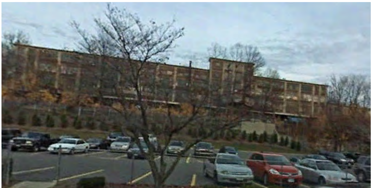
Figure 6. 284 N. Main St. (DeLorenzo Towers) (Imagery Date 11/2008) (Google, 2015)

The former location of Ingraham Clock Company (from 1958 to 1967) at 210 Redstone Hill Road is currently occupied by Rowley Spring and Stamping (Figure 7).