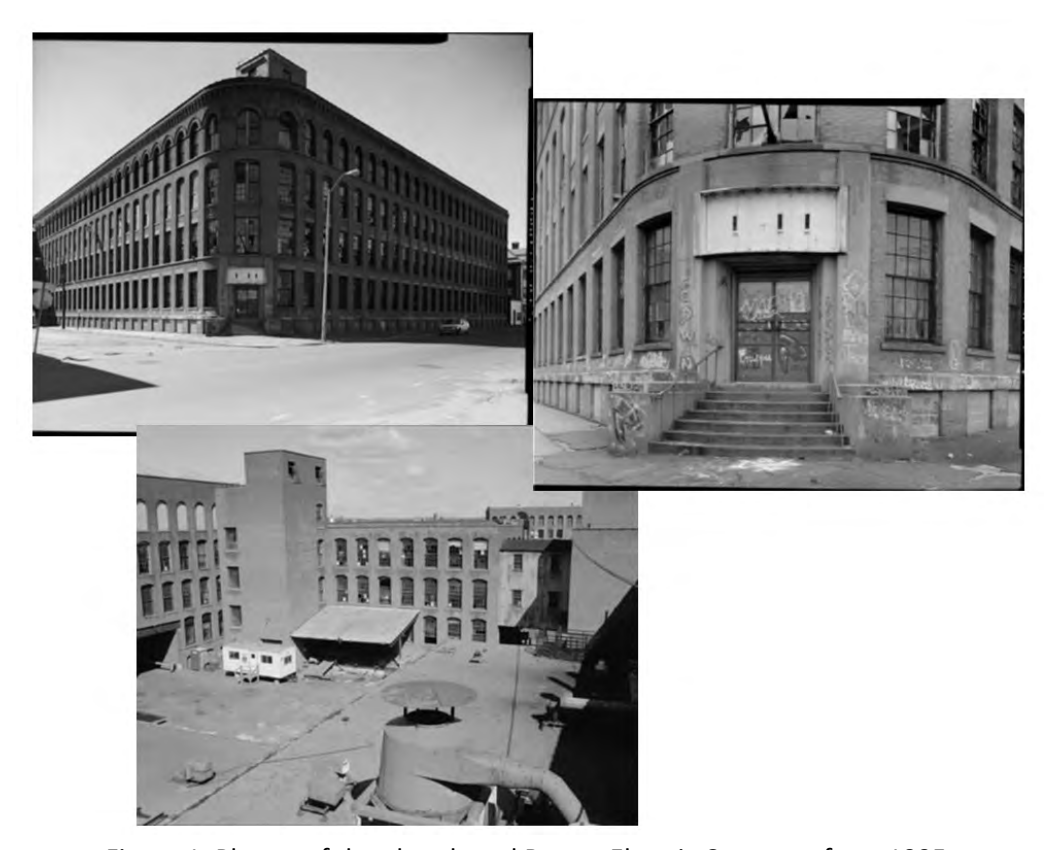
Figure 1. Photos of the abandoned Bryant Electric Company from 1995.

The amount/extent of radium contamination at these sites (including historical information and/or informed assumptions about the radium facilities' structures/areas, processes, and activities)