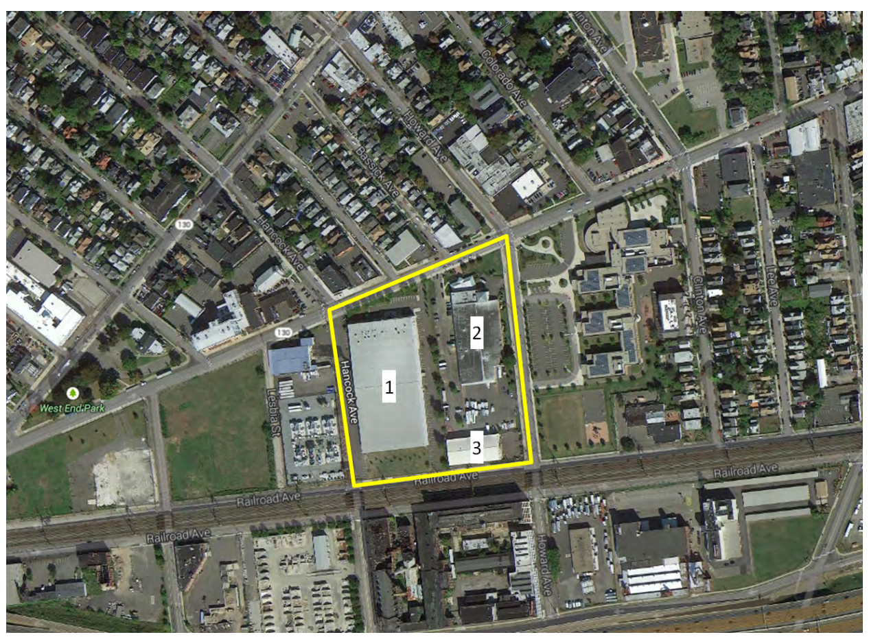
Figure 2. Former footprint of Bryant Electric Company, Bridgeport CT. 1 – West End Industrial Park; 2 – Chaves Bakery; 3 – possibly ASAP Bedliners (Google Earth, 2015)

Bridgeport is the most populous city in CT. It is located in Fairfield County on the Pequonnock River and Long Island Sound. According to the 2010 U.S. Census, the population of Bridgeport was 144,229; the 2014 population estimate for the city was 147,612 (United States Census Bureau, 2015).