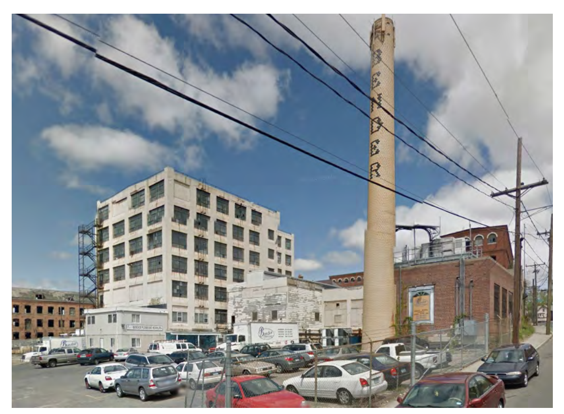
Figure 4. Southeast section of Benrus Clock Company, occupied by Bender Plumbing