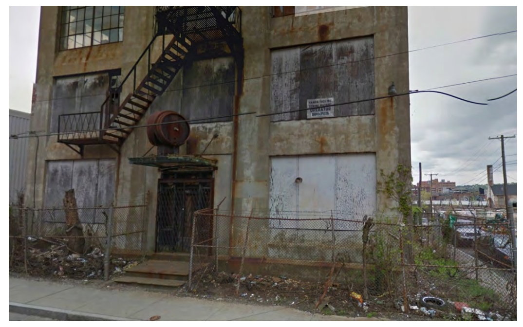
Figure 3. Entrance to old Benrus Clock Factory on Cherry Avenue (Google Earth, 2015)