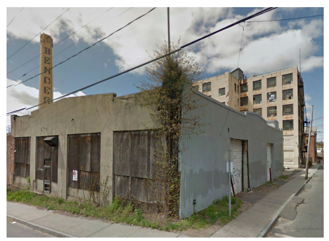
Figure 2. Benrus Clock Company (corner of Cherry Street and Cherry Avenue)