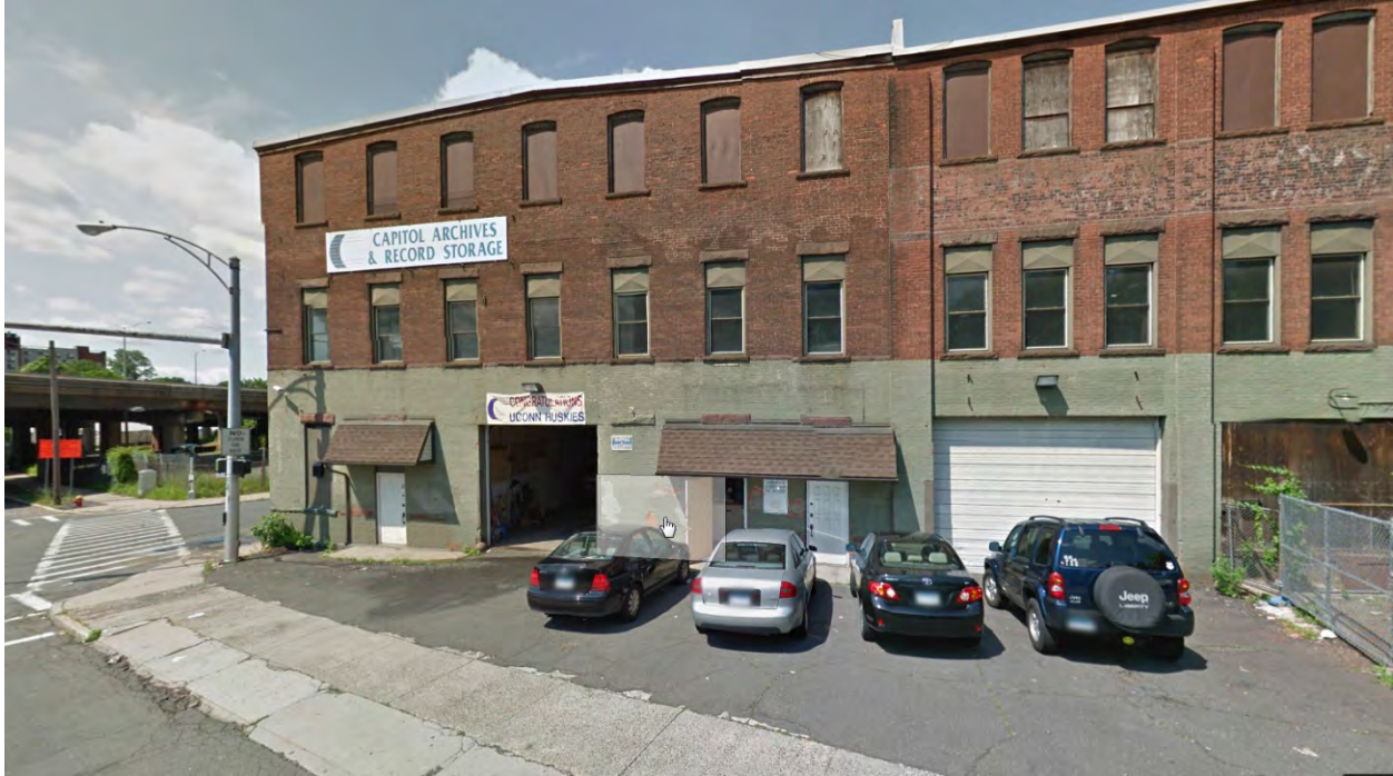
Figure 4. Capitol Archives and Record Storage in former Arrow Electric Company facility (Google Earth, 2011)