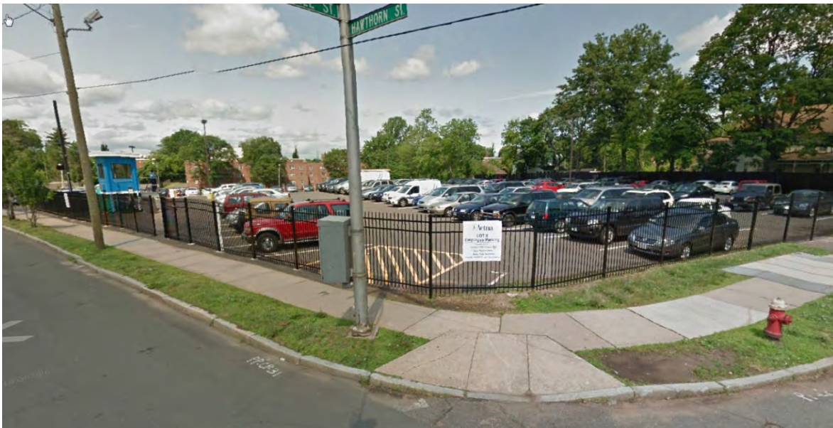
Figure 1. Approximate location of 103 Hawthorn Street

Based on the historical information, it is assumed that radium luminous flush switches and pull-chain pendants were manufactured at the facility located at 630 Capitol Avenue and in a building located at 103 Hawthorn Street. The building on Hawthorn Street burned in June 1999 and was subsequently removed; however, the soil at the site may be contaminated with radium. The Hawthorn Street site is currently a parking lot for the Aetna Life Insurance Company (see Figure 1). The facility located at 630 Capitol Avenue appears to still be standing today. Most of the facility is vacant (see Figure 2).