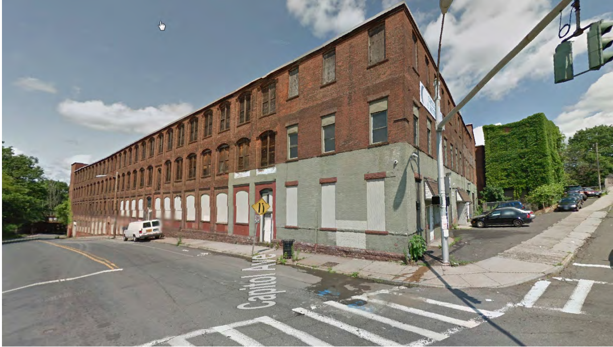
Figure 2. 630 Capitol Avenue