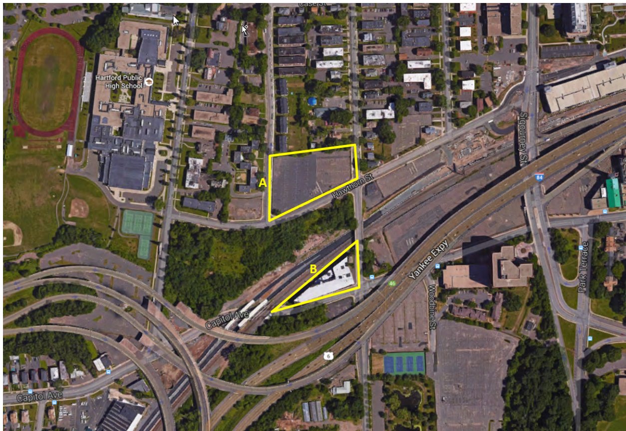
Figure 3. Aerial View of approximate locations of 103 Hawthorn Street (A) and 630 Capitol Avenue (B)

square miles. According to the 2010 U.S. Census, the population of Hartford was 124,775; the 2014 population estimate for the city was 124,705 (United States Census Bureau, 2015). See Figure 3.