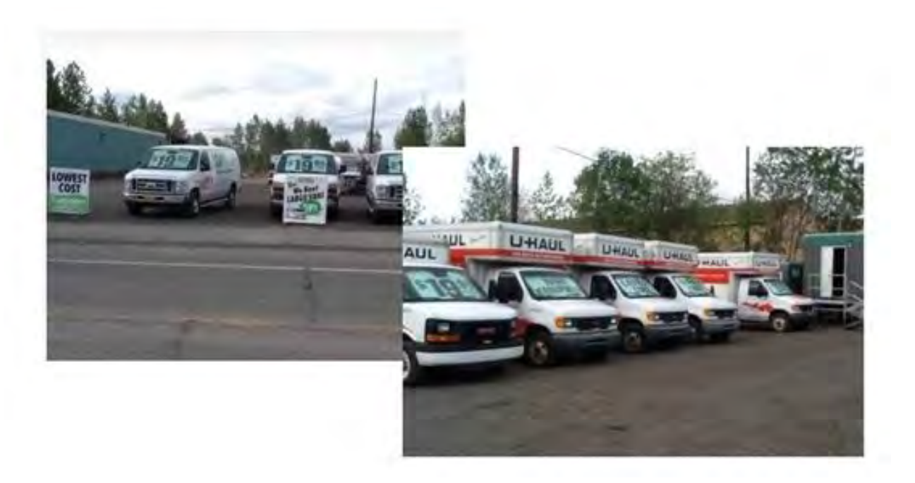
Figure 3. U-Haul Moving & Storage of North Anchorage (5700 Boundary Avenue) (Google Earth, 2015)

As of November 2015, U-Haul Moving & Storage of North Anchorage is located at the former Military Truck Salvage Yard (Figure 3).