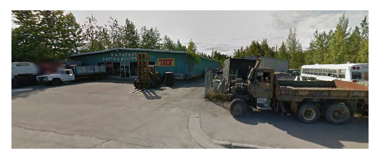
Figure 1. E.A. Patson Parts & Equipment (5700 Boundary Avenue) in July 2011

It is suspected that radium may have been present at the site in WWII-era vehicles and parts as luminous radium dials, gauges, and instruments.