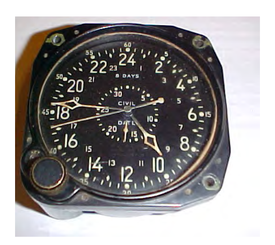
Figure 1. Waltham WWII CDIA 8 Day USN Aircraft Clock available for sale at War Dog Militaria (War Dog Militaria, 2015) (Image from May 2015)

This supplier carries genuine military surplus and collectibles dating back to pre-WWI. Some of the items for sale include WWII Aircraft dials, gauges, clocks and more (War Dog Militaria, 2015) (Figure 1). Due to historic documentation of luminous radium usage in vintage gauges, dials, and military instrumentation, it is suspected that radium was present in some of the items available for sale.