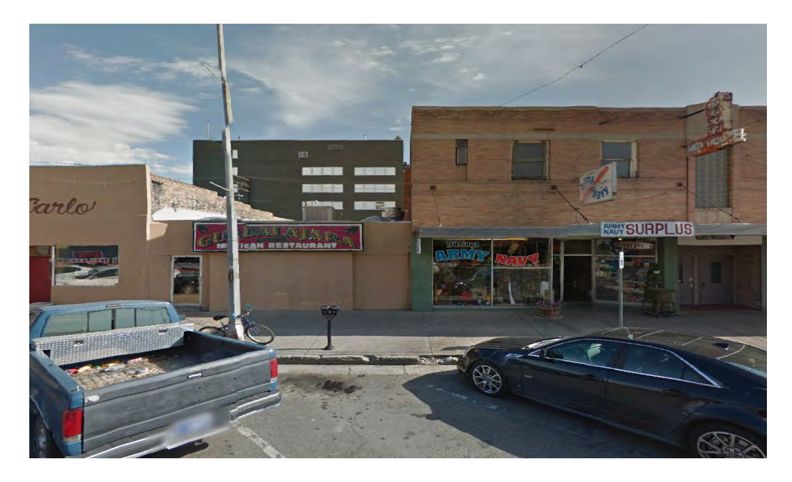
Figure 3. Billings Army Navy (15 N. 29<sup>th</sup> Street) previous site, located across the street from current location prior to 2012 (Google Earth, 2015, image captured Sept 2011)

The amount/extent of radium contamination at these sites (including historical information and/or informed assumptions about the radium facilities' structures/areas, processes, and activities)