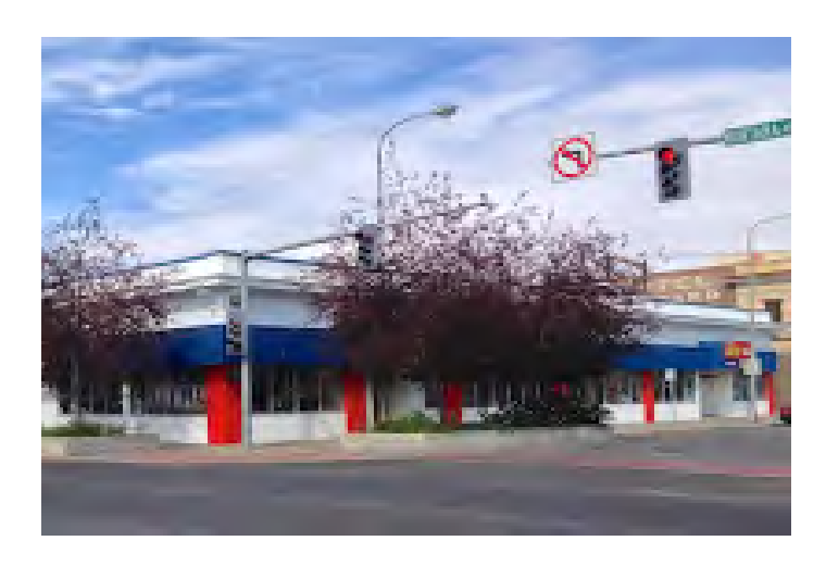
Figure 2. Billings Army Navy (10 N. 29<sup>th</sup> Street) current location since 2012