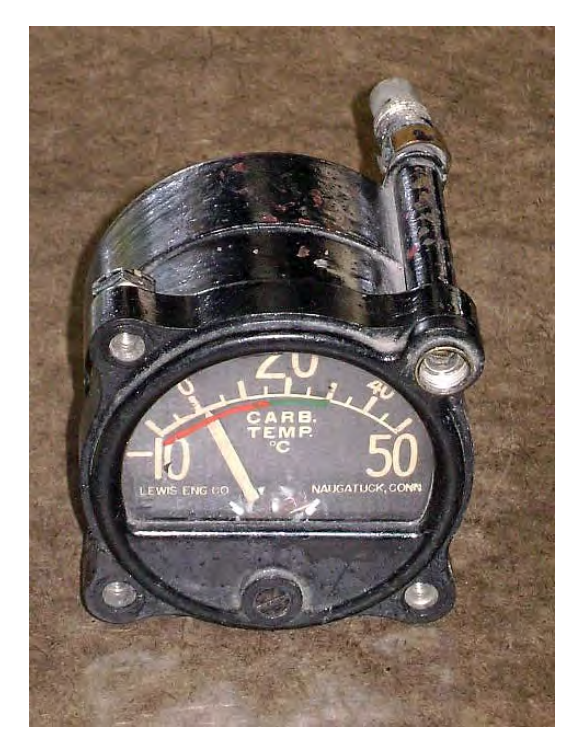
Figure 1. WWII era gauges available for sale (Billings Army Navy, 2015) (http://go-armynavy.com/military-surplus/vintage-aero-parts.html)