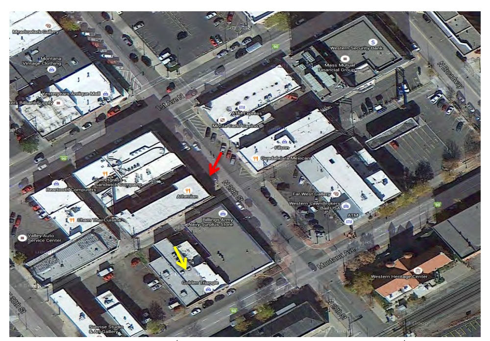
Figure 4. Location of current 10 N. 29<sup>th</sup> Street (yellow) and previous 15 N. 29<sup>th</sup> Street (red) sites and surrounding areas

Billings is located in Yellowstone County and is the largest city in MT. According to the 2010 U.S. Census, the population of Billings was 104,170; the 2014 population estimate for the city was 108,869 (United States Census Bureau, 2015). The Billings Army Navy stores are located in an area surrounded by businesses and residences (Figure 4).