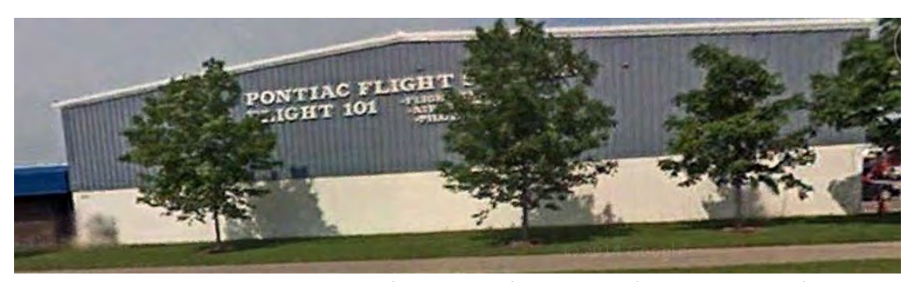
Figure 1. Approximate location of Metro Aircraft Instruments (Google Earth, 2015)

Due to historic documentation of luminous radium usage in vintage aircraft gauges, it is suspected that radium was present in some of the aircraft instruments repaired at this facility.