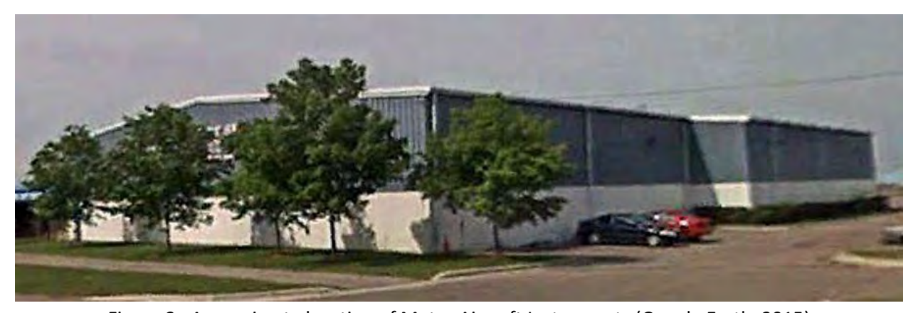
Figure 2. Approximate location of Metro Aircraft Instruments (Google Earth, 2015)