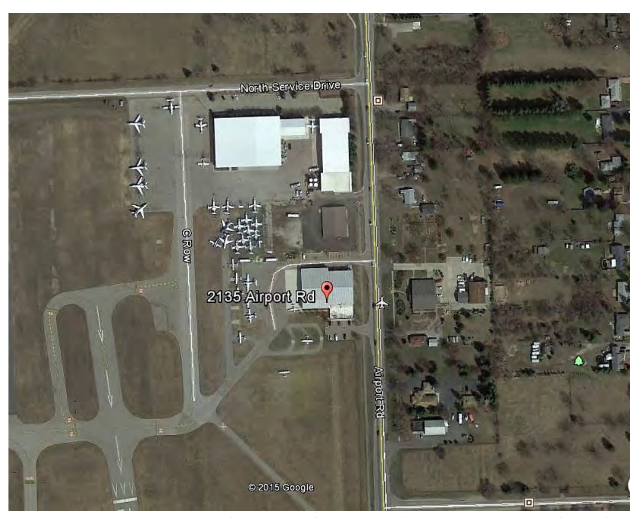
Figure 3. Approximate Location of Metro Aircraft Instruments (2135 Airport Road, Waterford, MI) (Google, Earth 2015)