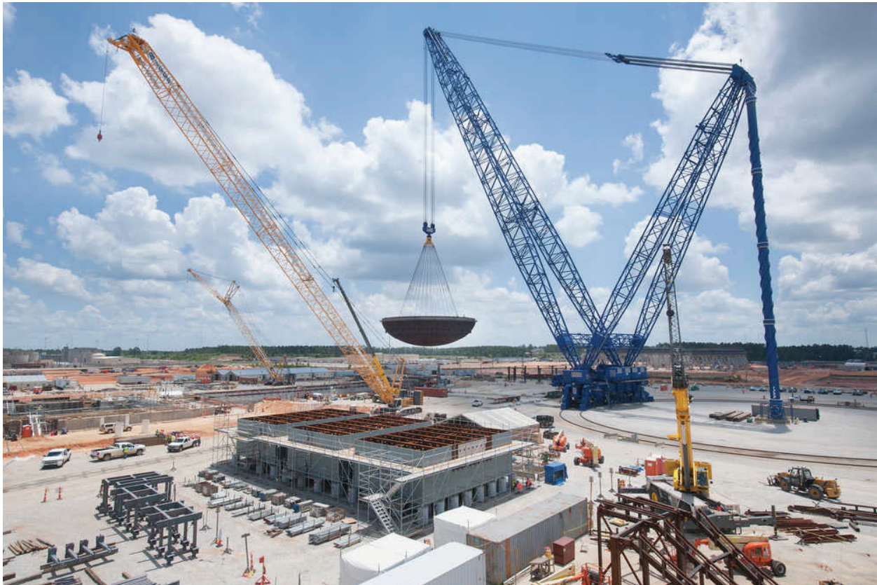
Containment vessel bottom head for Plant Vogtle's Unit 3 reactor

The NRC has developed performance indicators for tracking progression of the goals and strategies. The agency will then carry out the activities outlined in the enterprise roadmap, using the results of the performance indicators as input for the next iteration of the strategic planning process.