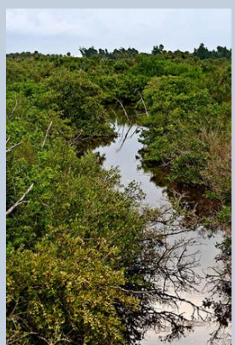
Greenery surrounding a creek at Pelican Island.