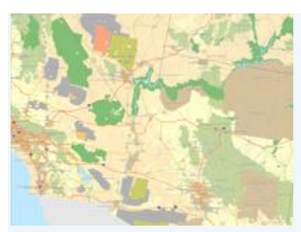
U.S. National Atlas Federal and Indian Land Areas.

Get the latest updates to Data and Maps right now by <u>downloading</u> a collection of layer packages through the Data and Maps for ArcGIS Group on ArcGIS Online.