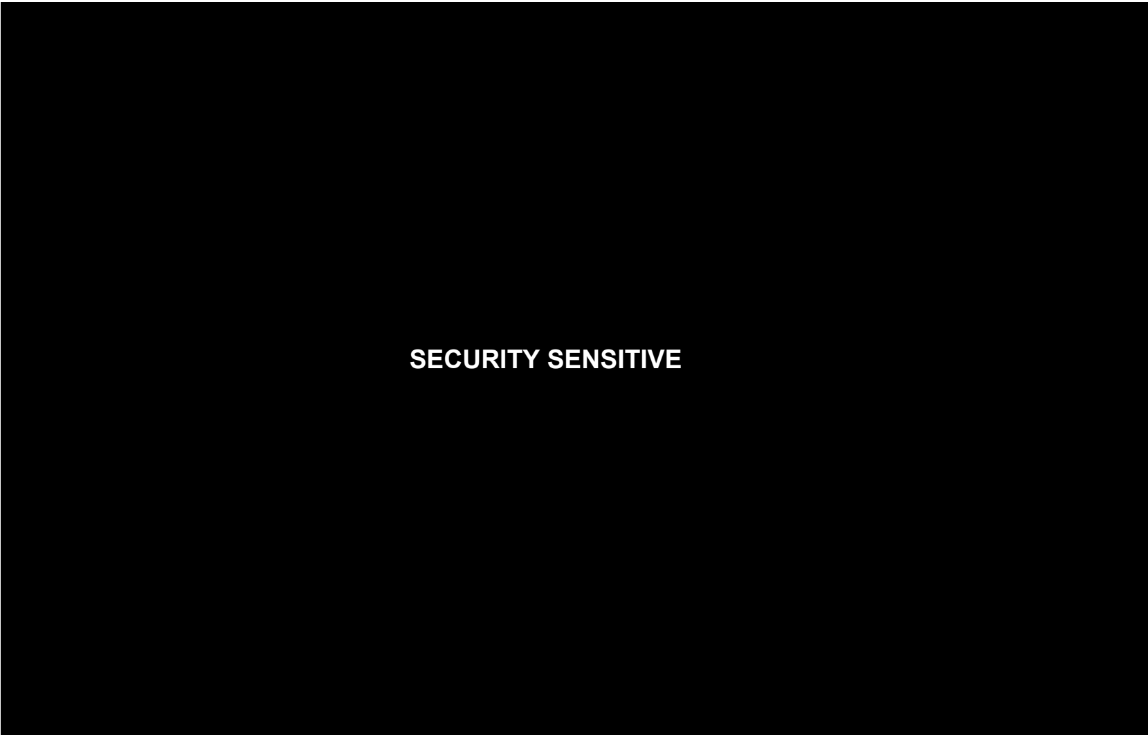
Figure 3.2p Control Building Radiation Zone Map for Full Power Operations, Section B-B