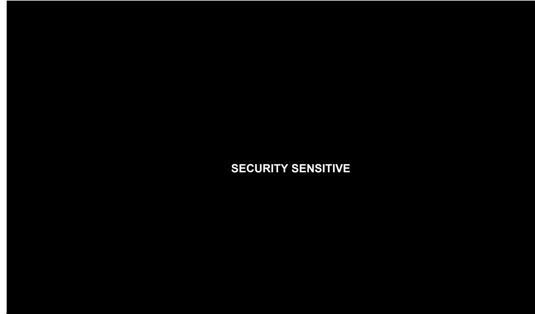
Figure 3.2u Control Building Radiation Zone Map for Full Power Operation, Floor 1F—Elevation 12300 mm