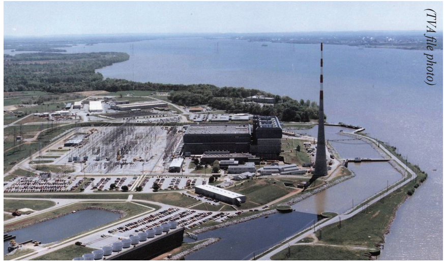
Aerial view of Browns Ferry Nuclear Plant

Structures, systems, and components important to safety shall be designed and located to minimize, consistent with other safety requirements, the probability and effect of fires and explosions. Noncombustible and heat-resistant materials shall be used wherever practical throughout the unit, particularly in such locations as the containment and control room.