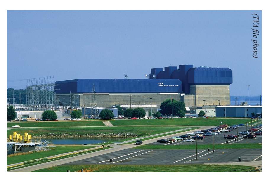
The three-Unit Browns Nuclear Power Plant, Limestone County, AL, owned and operated by the Tennessee Valley Authority