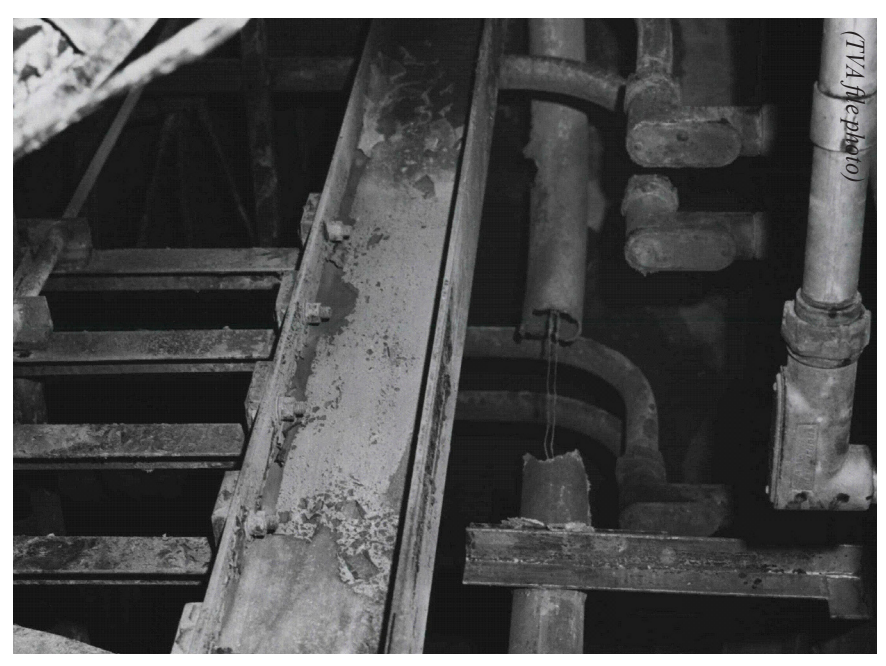
Picture of Browns Ferry Fire Cable Spreading Room. Note the melted aluminum electrical cable conduit.

The Energy Reorganization Act of 1974 established the NRC as a regulatory agency. The BFN fire occurred 3 months after the NRC began operations in January 1975.