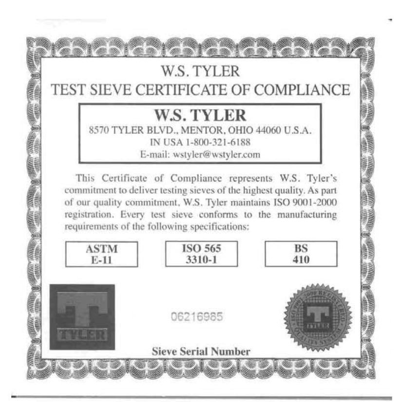
Table 21. Sieve Certificate of Compliance for the #270 Sieve (Top) and #400 Sieve (Bottom).