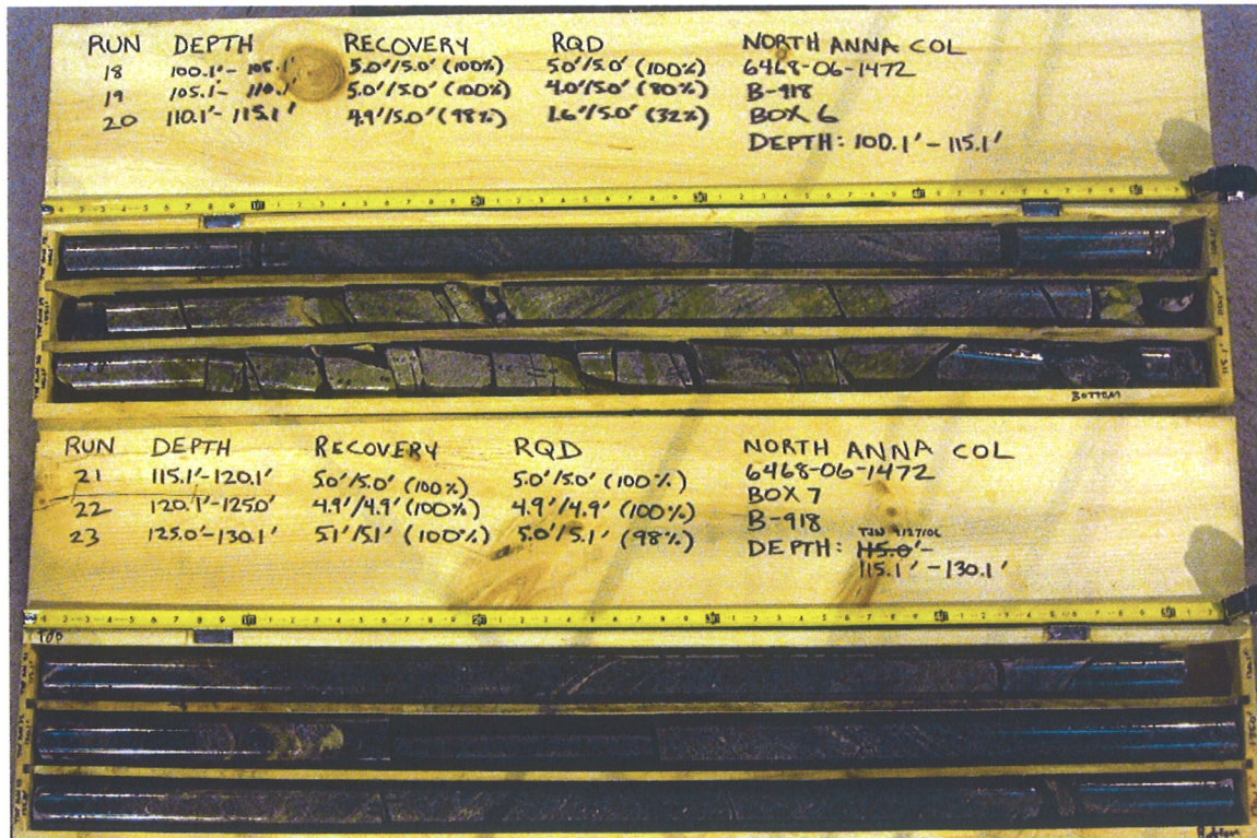
B-918 - Box 6 B-918 - Box 7