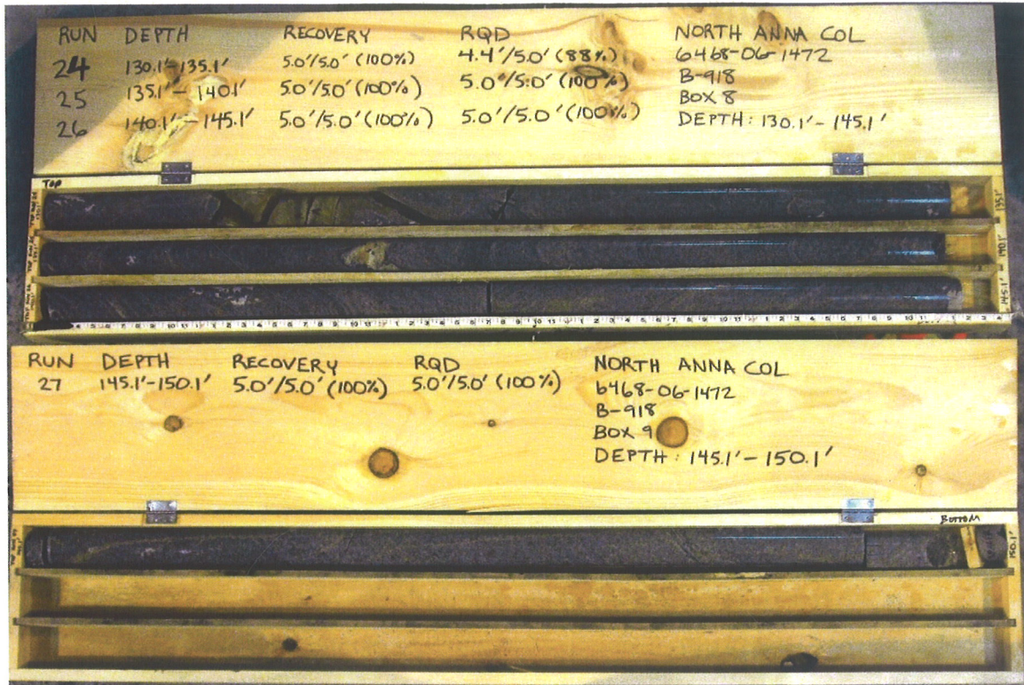
B-918 - Box 8 B-918 - Box 9