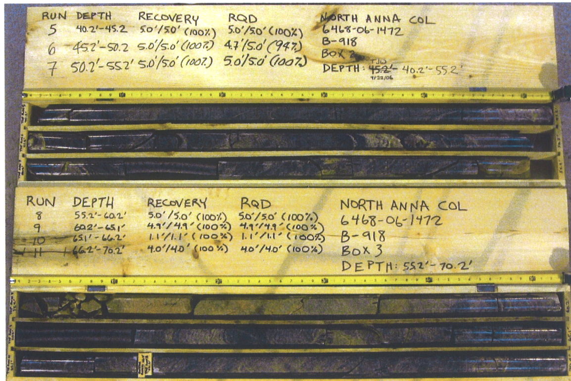
B-918 - Box 2