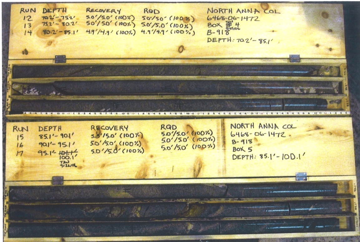
B-918 - Box 4 B-918 - Box 5