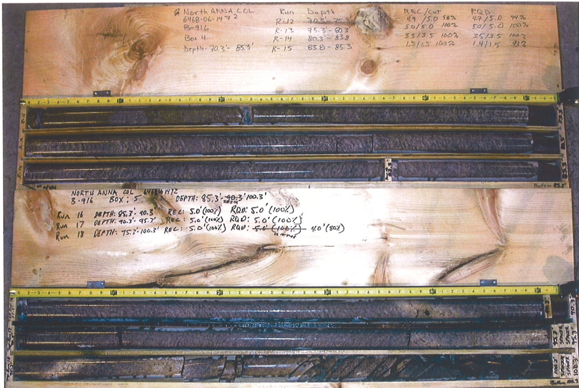
B-916 - Box 4 B-916 - Box 5