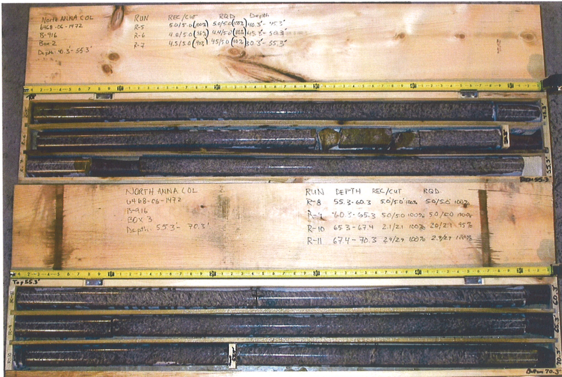
B-916 - Box 2