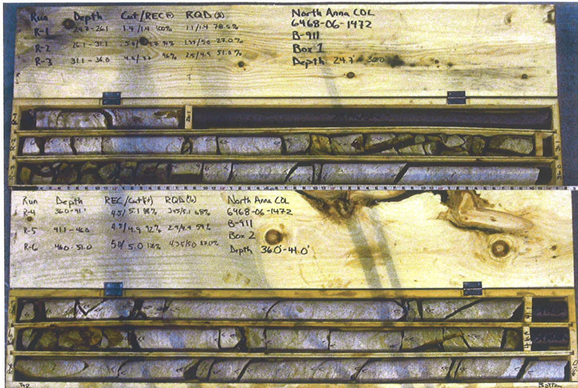
B-911 - Box 1 B-911 - Box 2