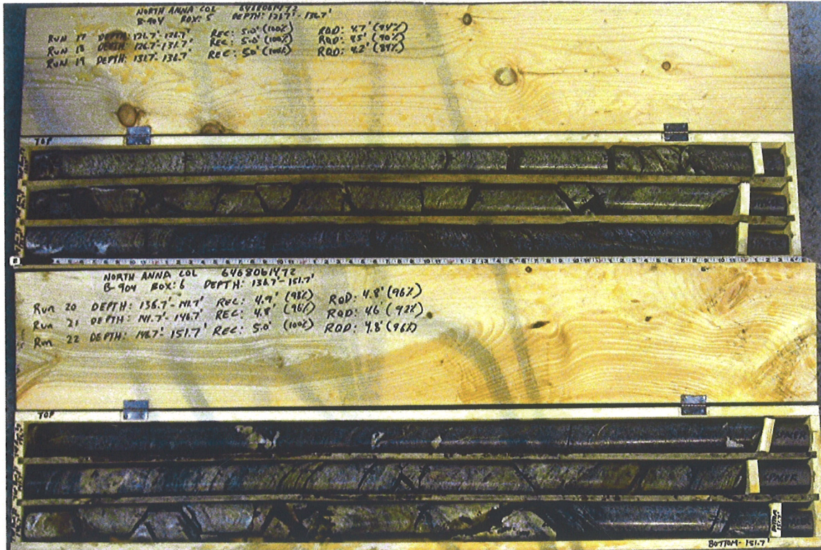
B-904 – Box 5