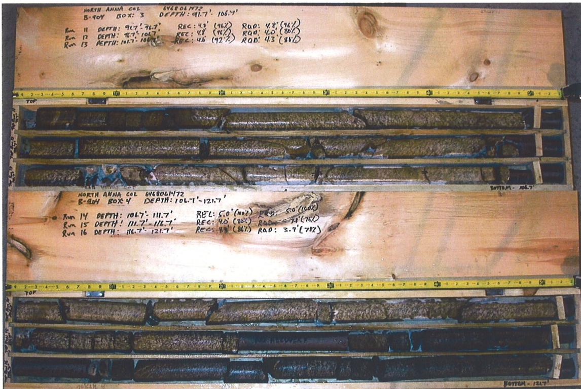
B-904 – Box 3 B-904 – Box 4