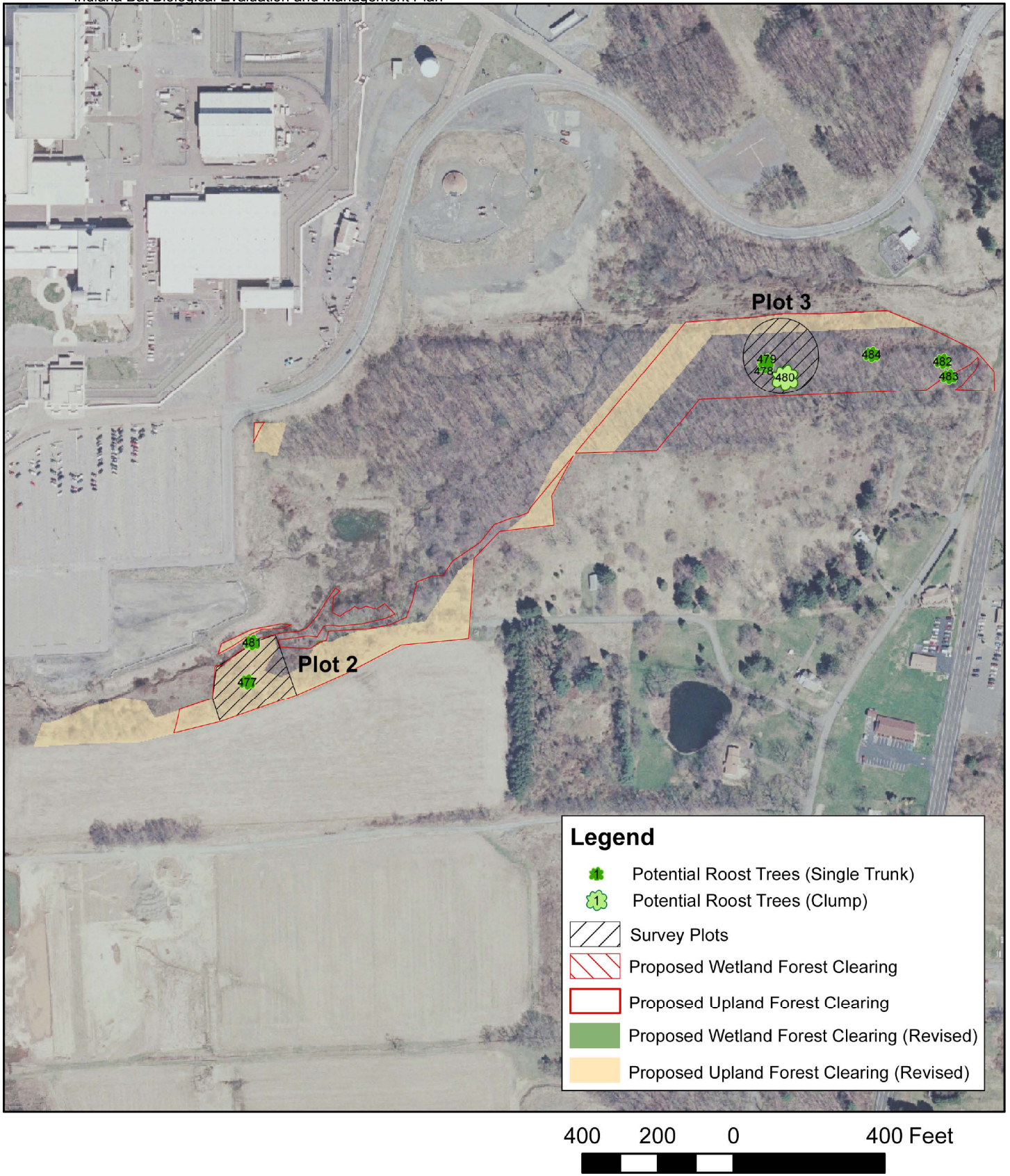
Figure D-16. BBNPP Forest Area 25 Potential Roost Tree Locations