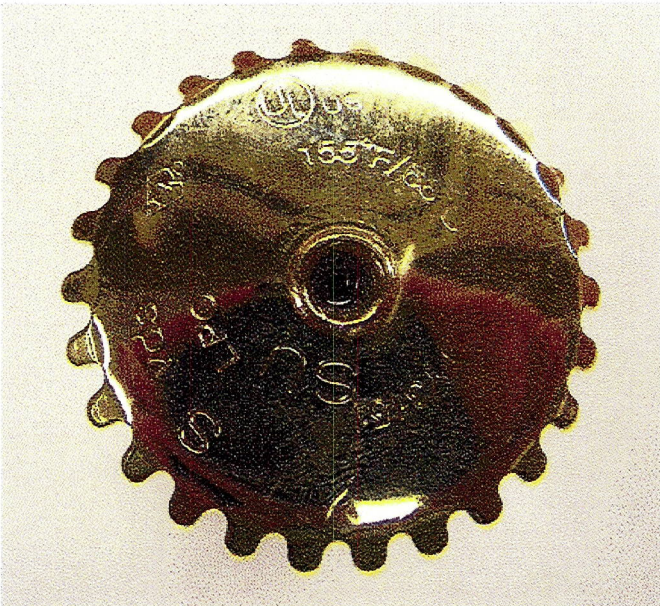
Sold at: Unknown