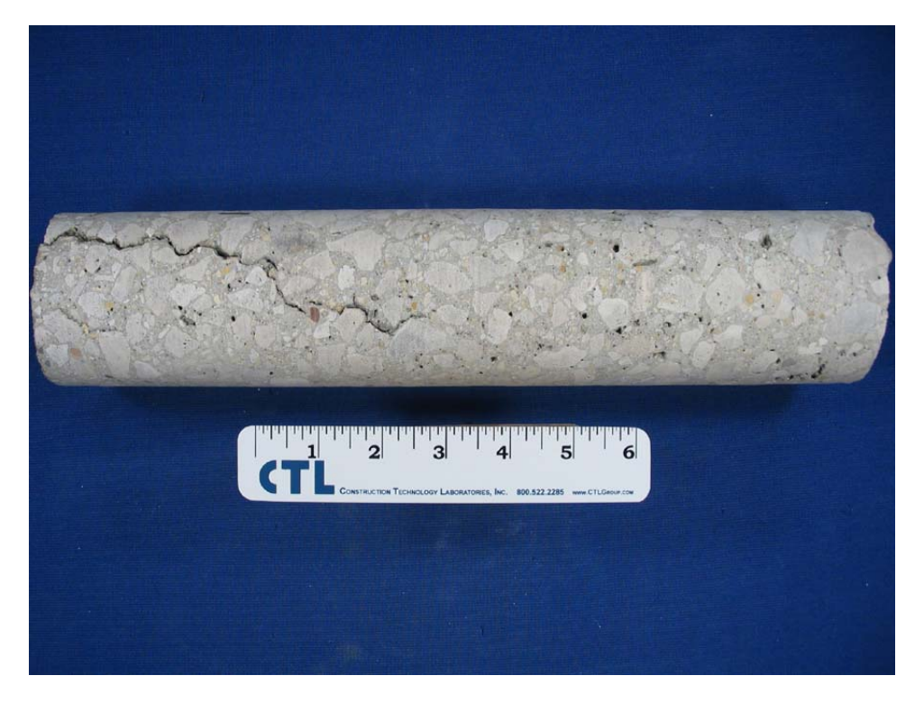
Fig. 2 Side view of core sample, as received. Top surface is to the left.