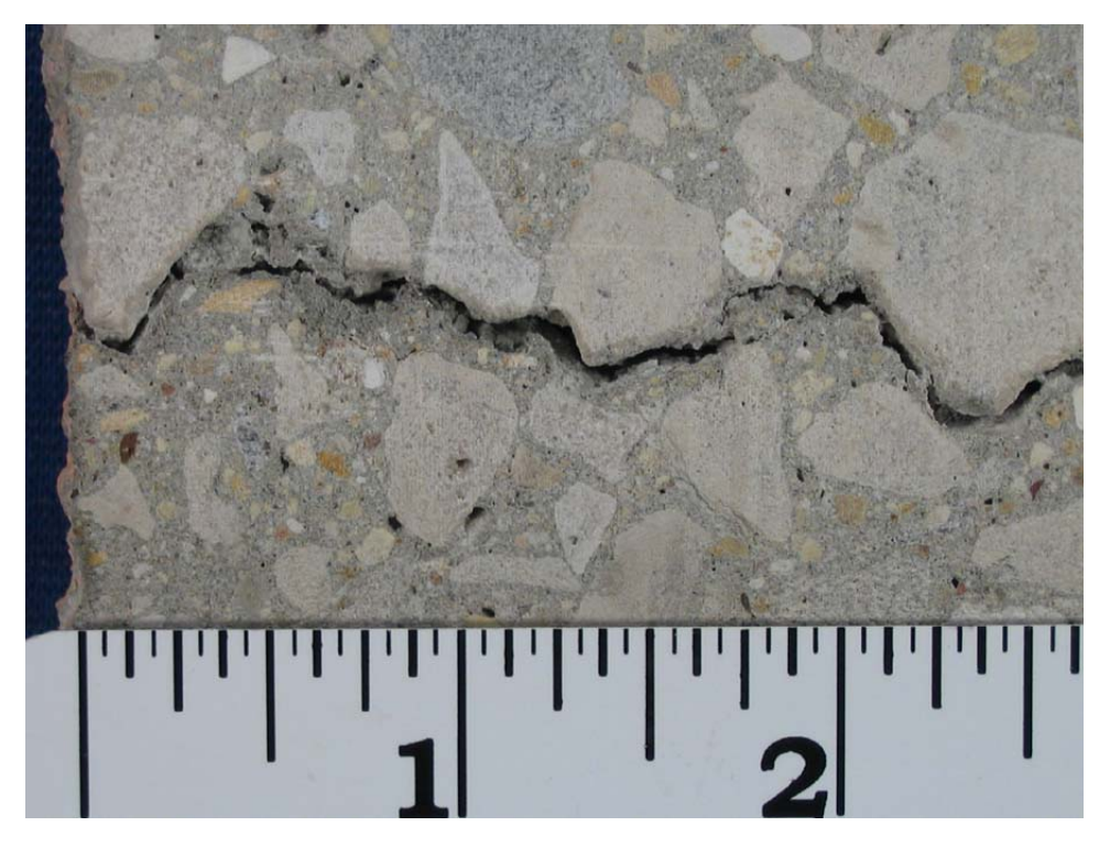
3b. Cored cylindrical surface