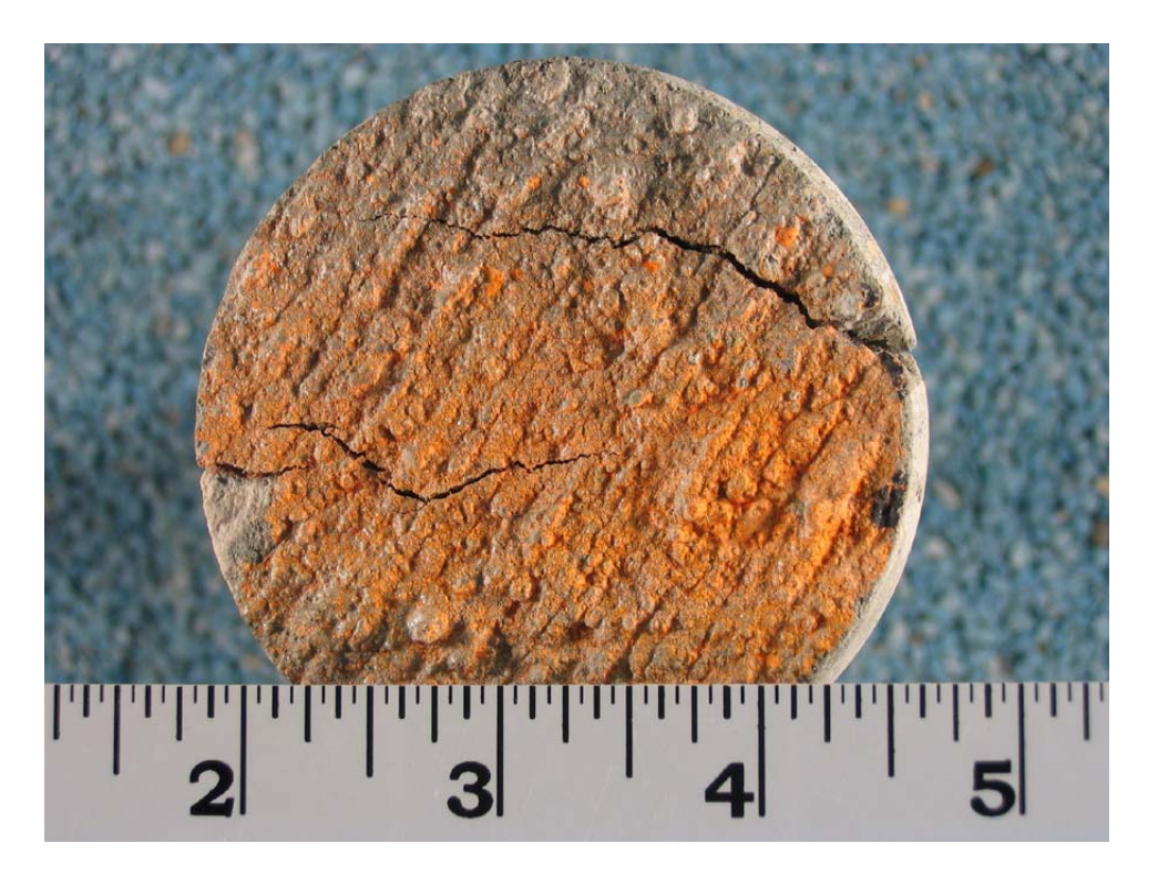
Fig. 1 Top surface of core sample, as received.