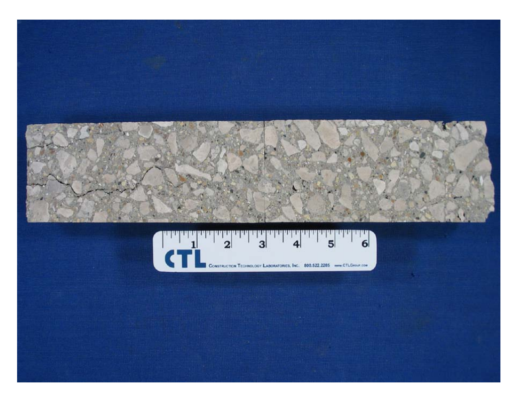
Fig. 4 Lapped cross-section of the core sample showing the general appearance and condition of the concrete. Top surface is to the left.