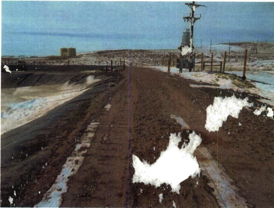
North side of pond looking West