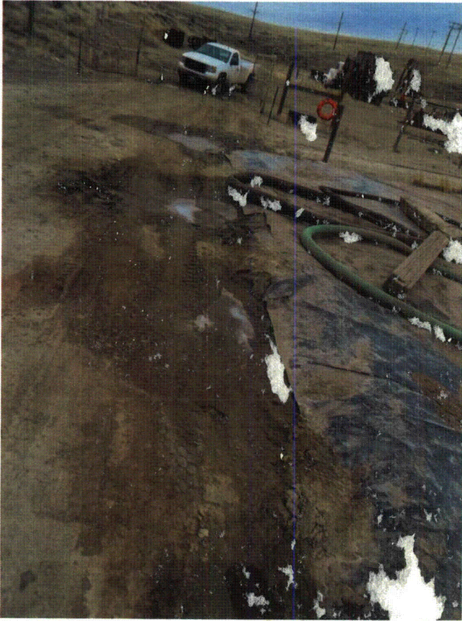
North side of pond looking East