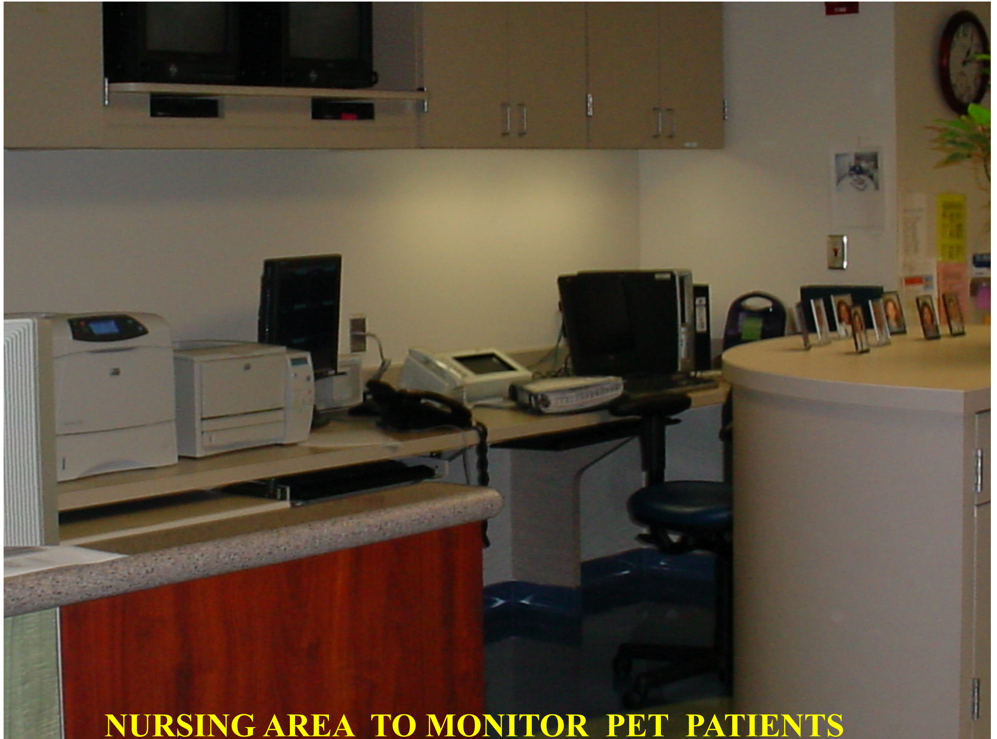
NURSING AREA TO MONITOR PET PATIENTS