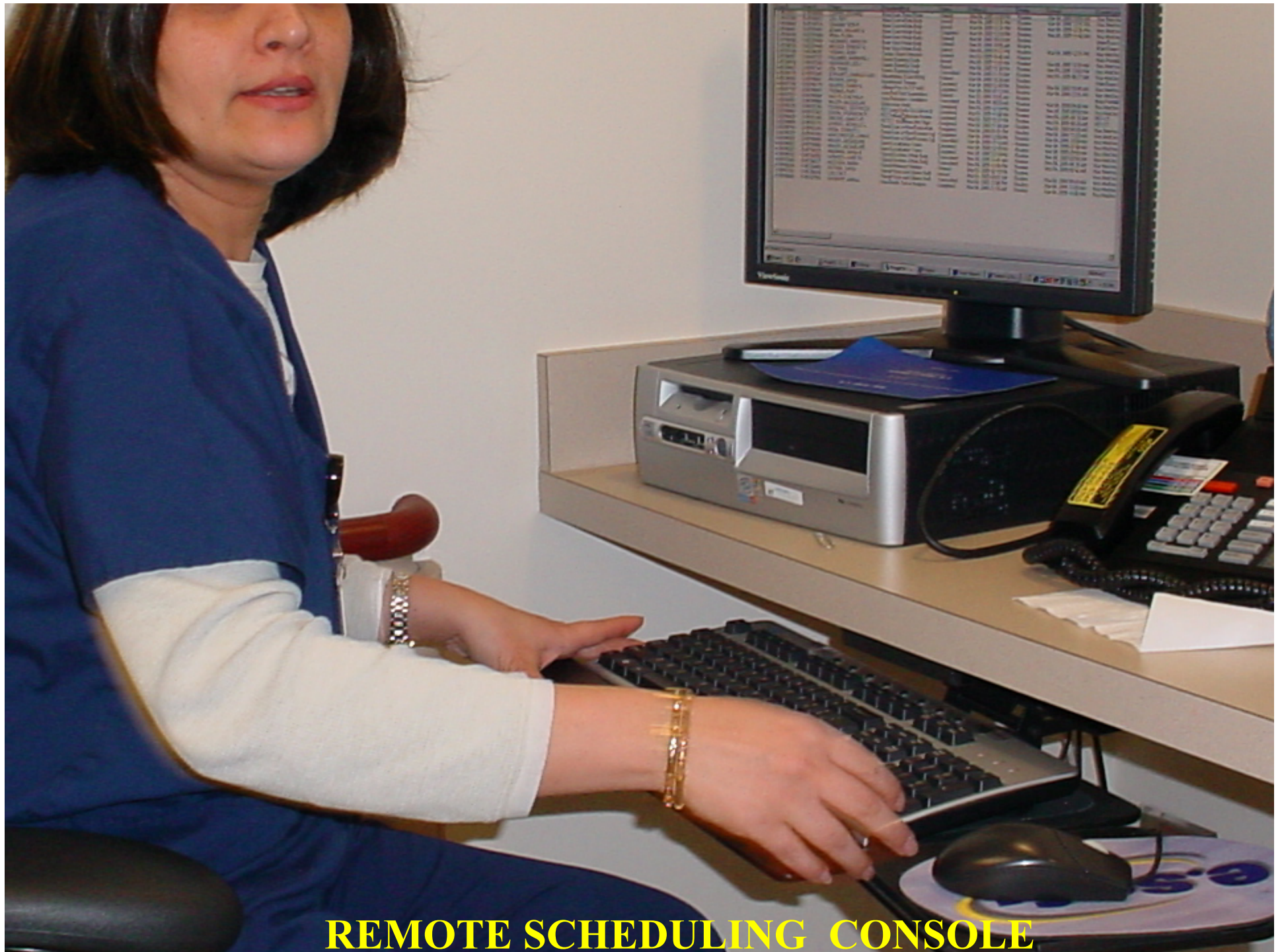
REMOTE SCHEDULING CONSOLE