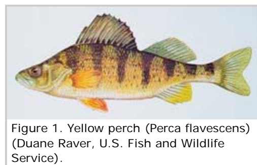
Figure 1. Yellow perch ( Perca flavescens ) (Duane Raver, U.S. Fish and Wildlife Service).

Yellow perch (Figure 1) feed on small fish, mayfly larvae, caddisfly larvae, amphipods, chironomids, and zooplankton. Mayflies are a very important food resource for the yellow perch fishery. From the late 1980s through the 1990s, after a 40-year absence due to pollution and eutrophication, large benthic invertebrates including mayfly larvae, caddisfly larvae, and amphipods recolonized the basin (Bridgeman et al. 2006). When burrowing mayflies ( Hexagenia spp.) recolonized western Lake Erie in the mid-1990s as water quality improved, the yellow perch population once again increased. Yellow perch are very valuable economically and the species is an indicator of the ecological condition of Lake Erie (Bridgeman et al. 2006). Yellow perch are also beneficial because they feed on the nonnative, invasive round goby (Kubb 2000).